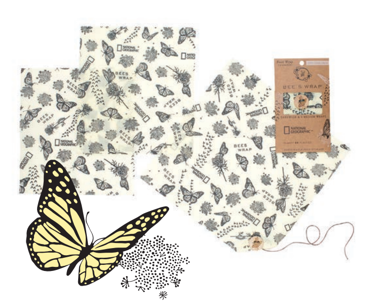
#EXP003 | EXPLORER PACK Monarch Print

Includes: 1 sandwich wrap with wooden bee button and hemp twine and 2 medium wraps