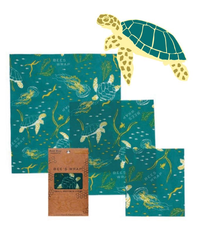
#OC3003 | ASSORTED 3 PACK (S, M, L) Oceans Print

If we don't reverse course, our oceans could contain more plastic than fish by 2050. Already, plastic pollution litters our shores, clogs our waterways, and kills millions of marine animals each year. Single-use plastics are among the greatest culprits of this pollution. Join us as we stem the tide on plastic pollution, and learn more about our giving at beeswrap.com/pages/giving-back.