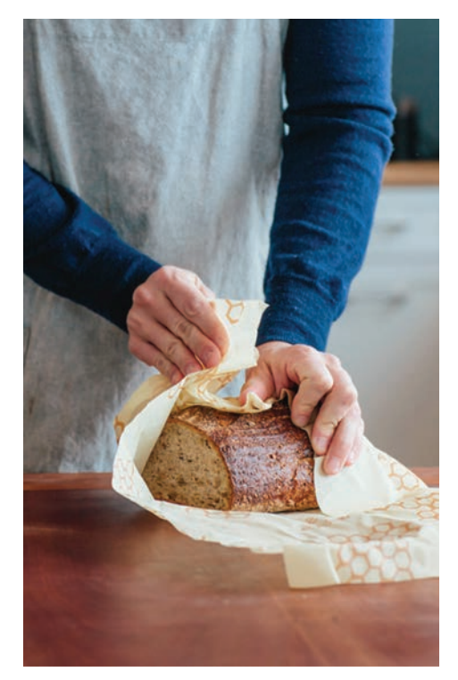
Bee's Wrap Wholesale Catalog