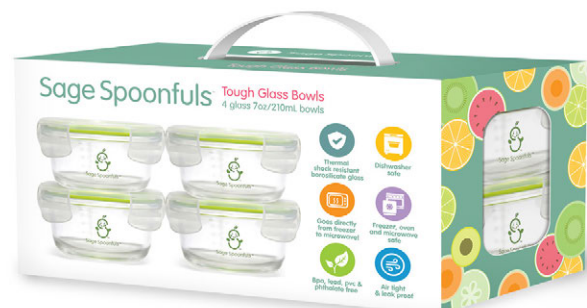
Tough Bowl 4 Pack ST18200