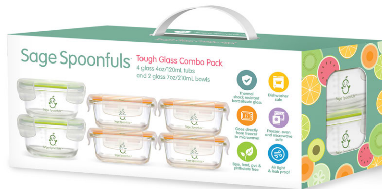
Tough Glass Combo Pack ST18300