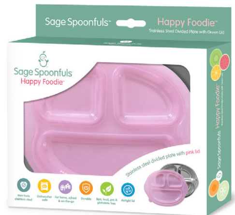
Happy Foodie, Pink Lid SS14300