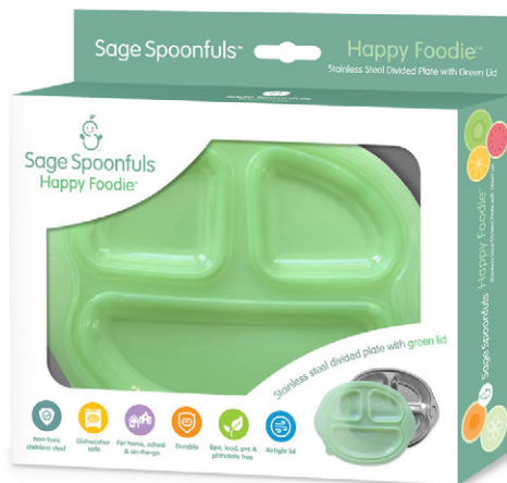
Happy Foodie, Green Lid SS14200