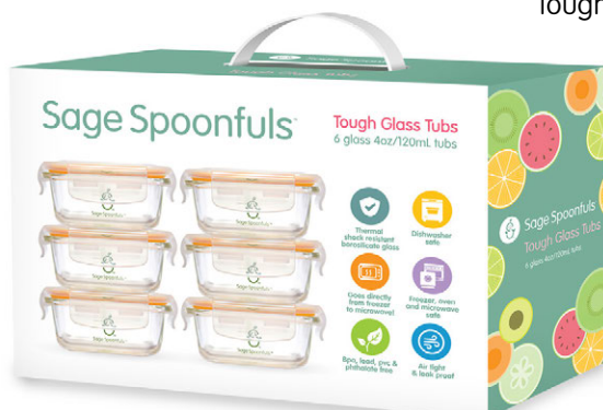
Tough Tub 6 Pack ST18100