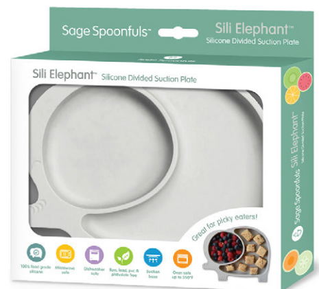
Sili Elephant, Gray SS17903