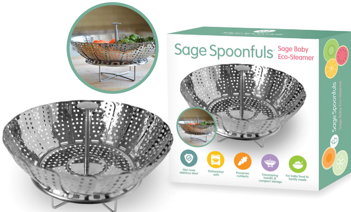
Sage Baby Eco-Steamer SS17540