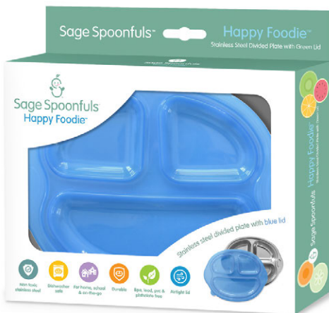
Happy Foodie, Blue Lid SS14100