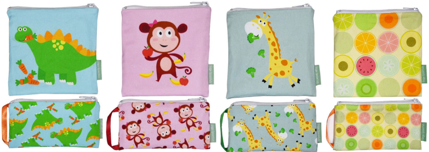
Dinosaur – SS17701