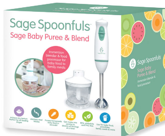
Sage Baby Puree & Blend SS17519