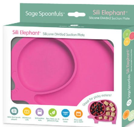
Sili Elephant, Pink SS17902