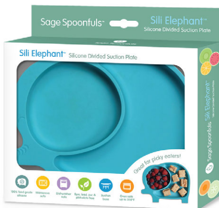
Sili Elephant, Blue SS17901