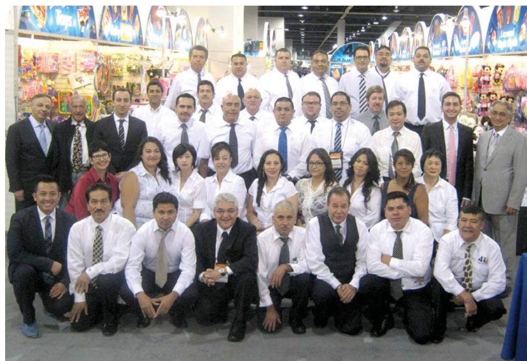
Visit our booth every year at the ASD Las Vegas show