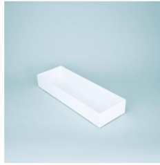
12.4" (4.13" x 12.4" x 1.97") #: 80-1026-05