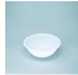
8.66" x 8.66" x 3.15" (large) #80-1048-05