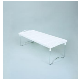
Large (23.82" x 9.45" x 8.46") #80-1075-05