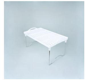
Medium (15.94" x 9.45" x 8.46") #80-1076-05