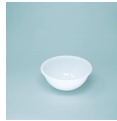
7.09" x 7.09" x 2.95" (small) #80-1047-05