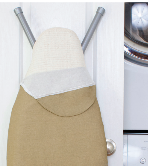
Treated Pad & Cover Set #81100