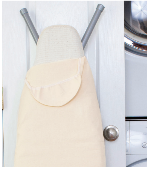
Natural Pad & Cover Set #81000