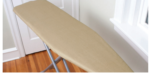
Treated Ironing Board Cover #80100