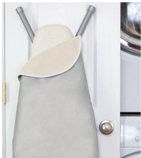
Silicone Pad & Cover Set #98402