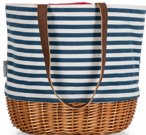
CORONADO PICNIC BASKET