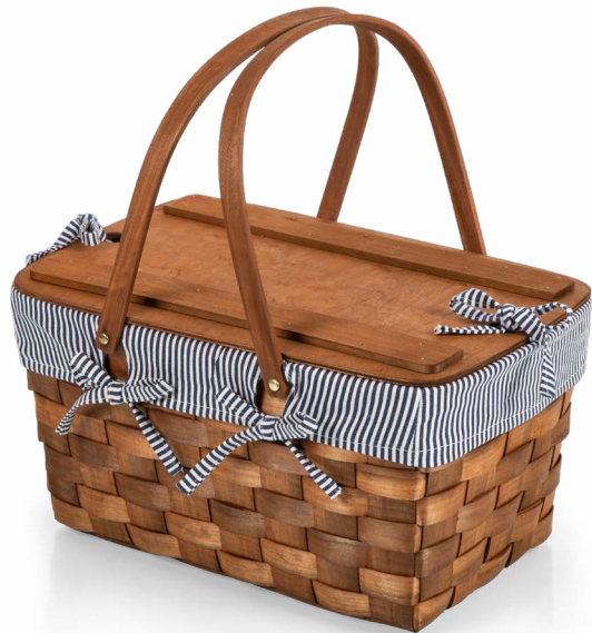
KANSAS PICNIC BASKET