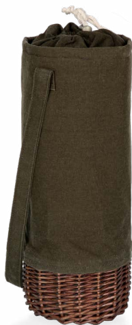
MALBEC WINE BASKET