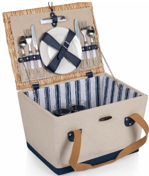
BOARDWALK PICNIC BASKET