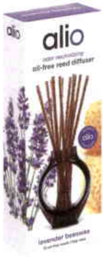
lavender beeswax AD101

Continuous odor control for up to 45 days. Suited for small spaces like kitchens and bathrooms.