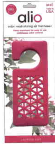
AH104 jasmine rain