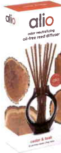
cedar & teak AD103