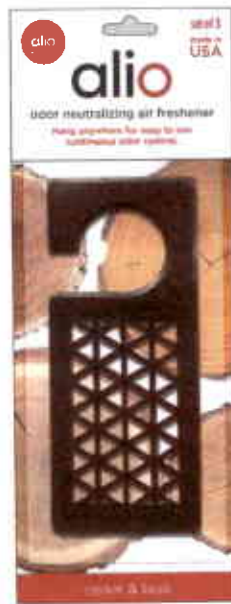
AH103 cedar & teak