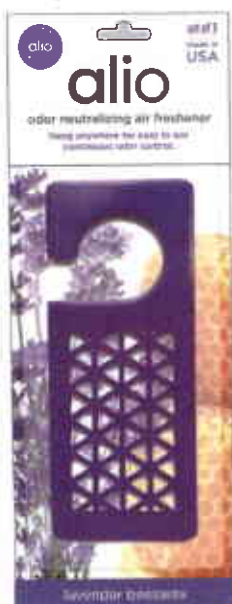
AH101 lavender beeswax

Continuous odor control for up to 45 days. Perfect for hanging in small spaces like closets and bathrooms.