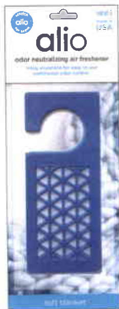
AH102 soft blanket