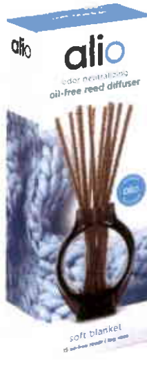
soft blanket AD102