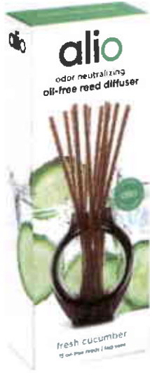
fresh cucumber AD104