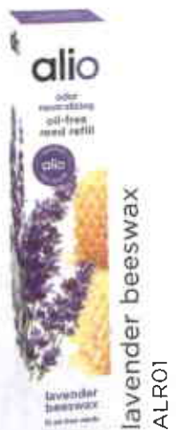
lavender beeswax ALR01

Replenish the vase or use reeds individually. Perfect for shoes, drawers or any space that needs a little refresh.