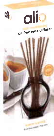
warm vanilla AD105