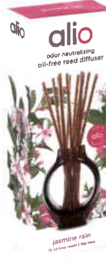
jasmine rain AD106