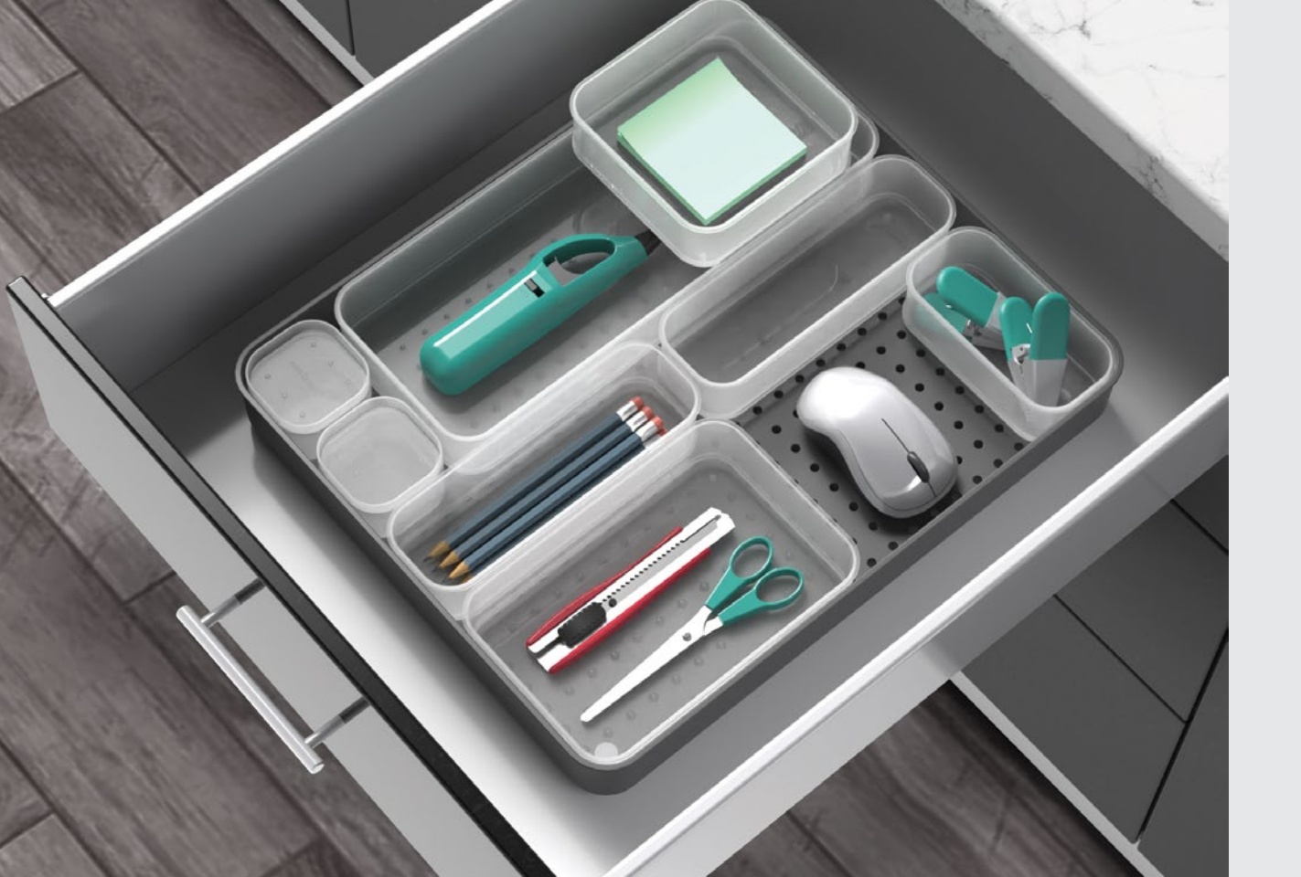
DRAWER | VALUE COLLECTION junk drawer organizer® 2020 | stack + slide