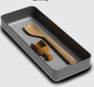
item # 26645 | patent pending 14.04 x 5.52 x 1.95 in (35.65 x 14.03 x 4.96 cm)