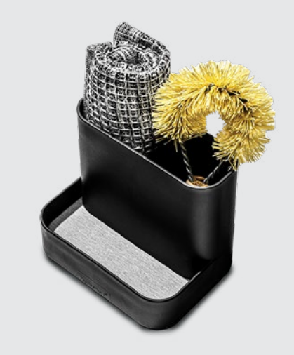
item # 18127 | patent pending 4.39 x 3.22 x 3.85 in (11.15 x 8.17 x 9.77 cm)