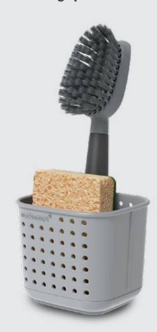
item # 29237 | patent pending 3.98 x 3.69 x 3.40 in (10.12 x 9.37 x 8.65 cm)