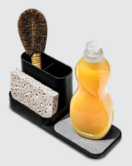
item # 18128 | patent pending 8.74 x 3.22 x 3.85 in (22.19 x 8.17 x 9.77 cm)