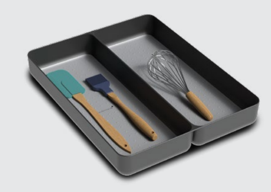
item # 26605 | patent pending 14.01 x 11.03 x 1.91 in (35.57 x 28.01 x 4.86 cm)