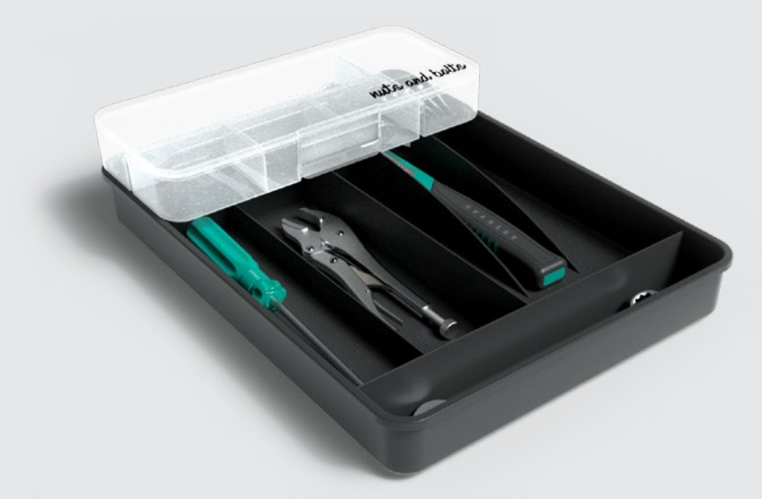
Dry-erase label space on case for custom organization

item # 29246 | patent pending 12.40 x 16.40 x 2.20 in (31.40 x 41.60 x 5.50 cm)