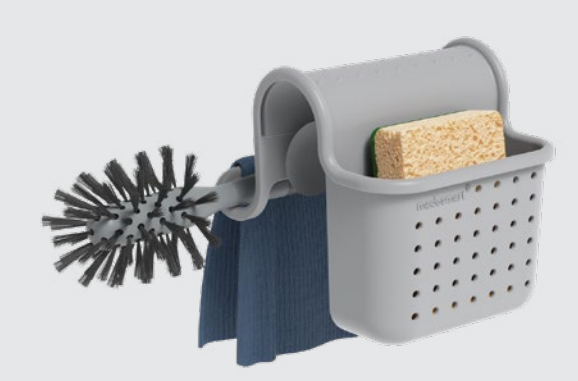
item # 29238 | patent pending 4.84 x 5.69 x 5.09 in (12.30 x 14.45 x 12.93 cm)