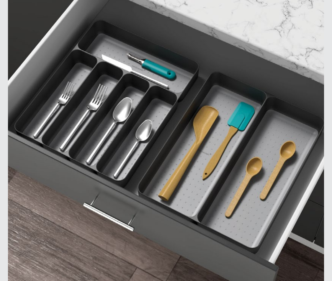
item # 26602 | patent pending 13.94 x 10.97 x 1.93 in (35.40 x 27.87 x 4.90 cm)