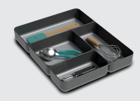
item # 26622 | patent pending 14.03 x 11.01 x 1.95 in (35.65 x 27.97 x 4.96 cm)