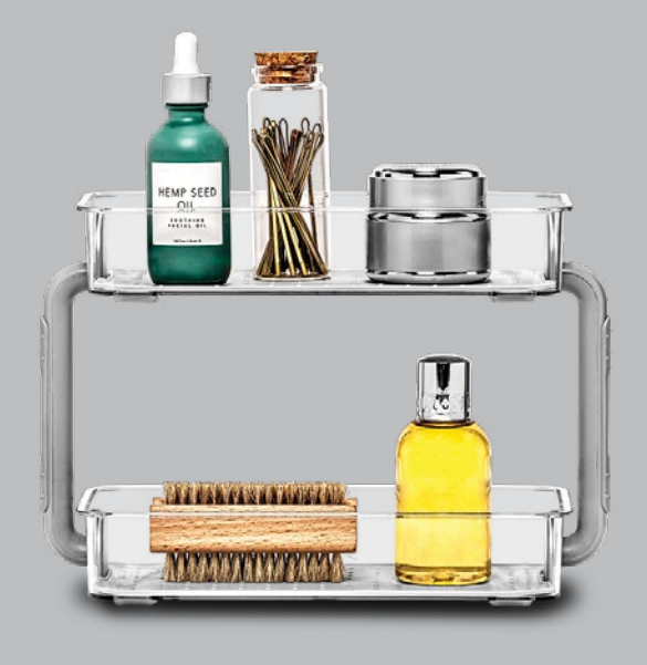
Two-levels to maximize vertical storage item # 79993

10.37 x 4.96 x 7.22 in, holds up to 4 lbs. (26.34 x 12.60 x 18.34 cm, holds up to 1.81 kg)