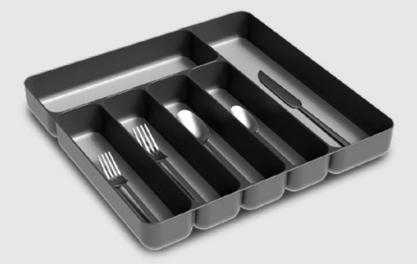
item # 26606 | patent pending 14.01 x 14.51 x 1.92 in (35.59 x 36.86 x 4.88 cm)