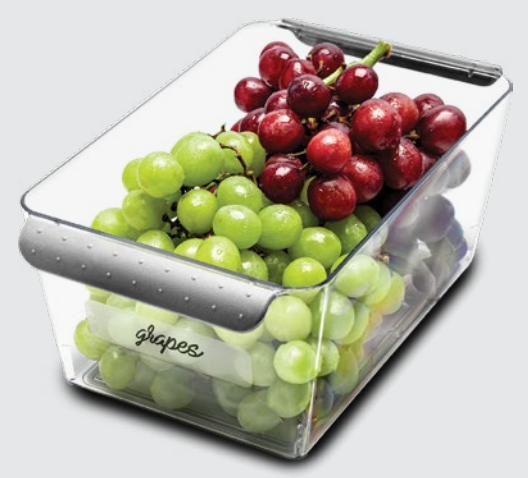
Food-safe | BPA-free item # 51014 | patent pending 10.06 x 5.99 x 4.19 in (25.55 x 15.21 x 10.64 cm)