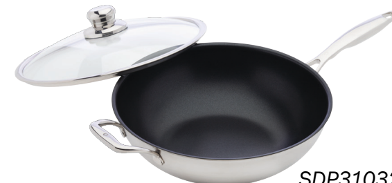
SDP31032ic 32cm (12.5") 5.5 L (5.8 Qt)