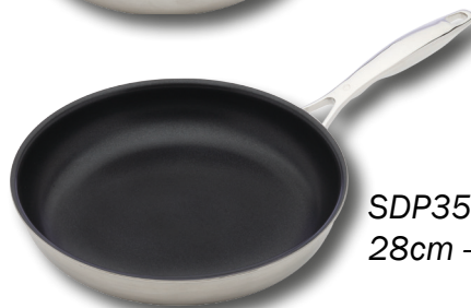
SDP3528i 28cm - 11"