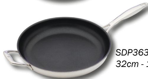
SDP3632i 32cm - 12.5"