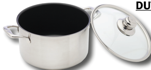
SDP31324ic 24cm (9.5") 6 L (6.3 Qt)