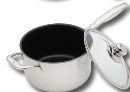
SDP31220ic 20cm (8") 3.5 L (3.7 Qt)