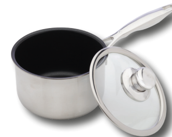
SDP31016ic 16cm (6.5") 2 L (2.1 Qt)