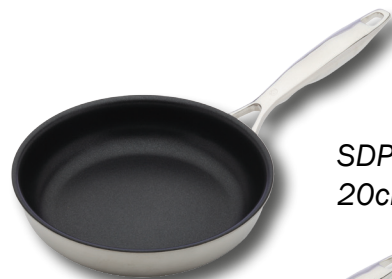
SDP3520i 20cm - 8"