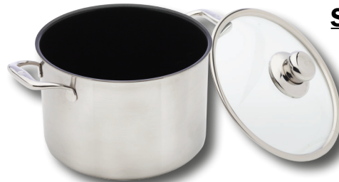
STOCK POT SDP31724ic 24cm (9.5") 7.5 L (7.9 Qt)