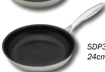
SDP3524i 24cm - 9.5"