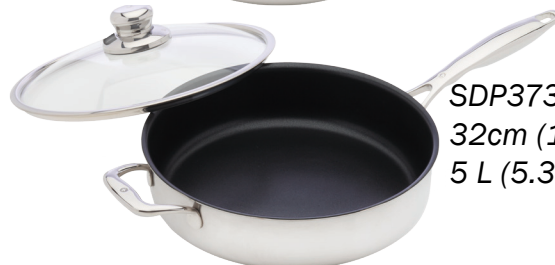
SDP3732ic 32cm (12.5") 5 L (5.3 Qt)