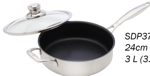
SDP3724ic 24cm (9.5") 3 L (3.2 Qt)