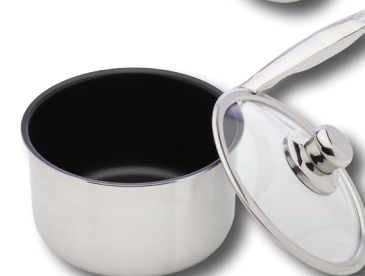
SDP31118ic 18cm (7") 2.5 L (2.6 Qt)