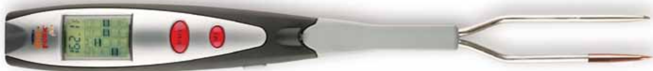
ET-64 REDIFORK PRO Taste Chart with Food Doneness Fast Read Tip for Quick Temperatures +32°F to +212°F / 0°C to +100°C