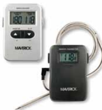
ET-710S SINGLE PROBE REMOTE Monitor Temperature to 100 ft +14°F to +410°F / -10°C to +210°C