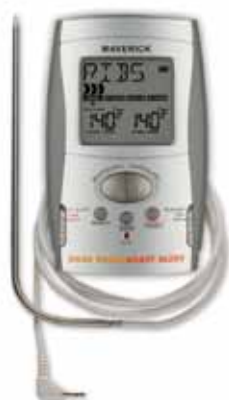
ET-83 DUAL PROBE ROASTING THERMOMETER 32°F to 212°F / 0°C to 100°C