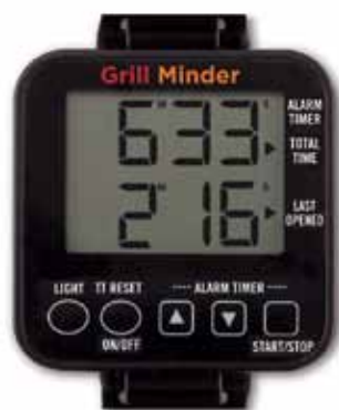
TM-10 GRILL MINDER Automatically Resets Every Time You Open & Close the Grill