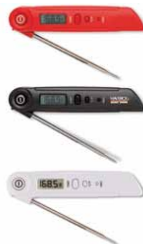
DT-13 FLIP TIP INSTANT READ Available in Red, Black, White +32°F to +572°F / 0°C to +200°C