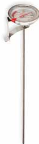
CT-05 LONG PROBE DEEP FRY THERMOMETER +100°F to +500°F / +38°C to +280°C