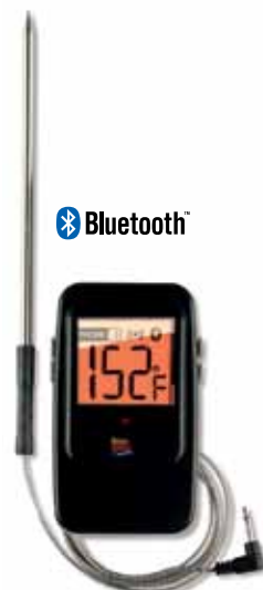
ET-735 BLUE TOOTH BBQ THERMOMETER 160 Foot Range 2 Hybrid Water-Proof Probes