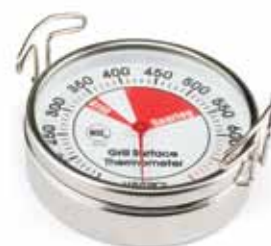
ST-01 SURFACE THERMOMETER NSF Approved • Color Dial +150°F to +700°F