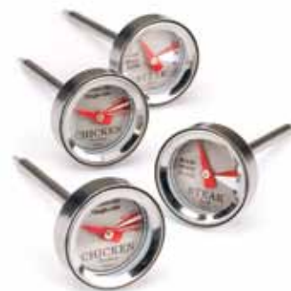
RT-04 SET OF FOUR MINI THERMOMETERS Two Beef Coded R, M, W Two Chicken