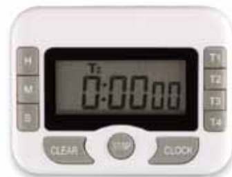
TM-09 FOUR LINE DIGITAL TIMER WITH CLOCK 99 Minute, 59 Second Timer