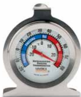
RF-01 REFRIGERATOR/FREEZER THERMOMETER Color Prompt Dial -20°F to +80°F / -10°C to +15°C