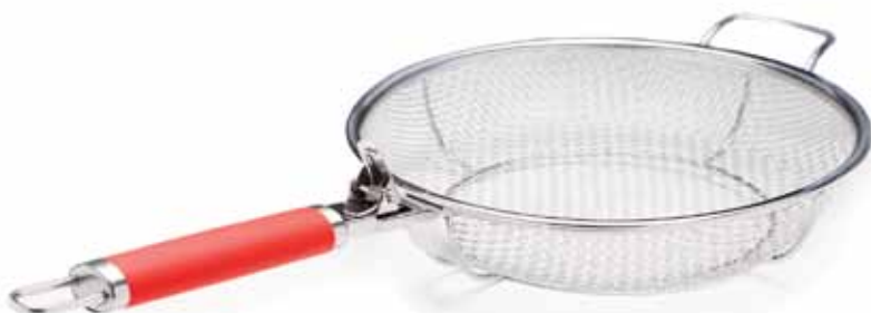
MFP-01R-RED STAINLESS STEEL MESH FRY PAN WITH RED HANDLE Removable Handle