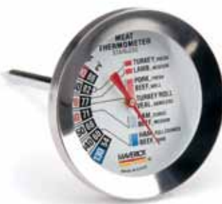
RT-01 LARGE DIAL ROASTING THERMOMETER Color Prompts for Type of Meat Doneness +130°F to +190°F / +54°C to +90°C