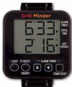
TM-10 GRILL MINDER Automatically Resets Every Time You Open & Close the Grill