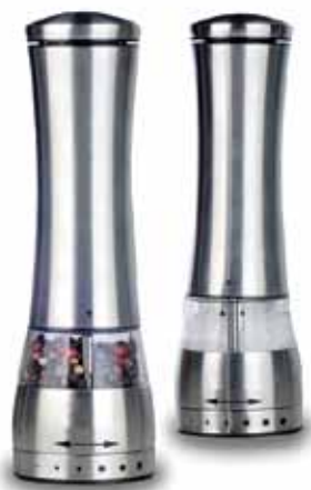
PM-022 ELECTRIC PEPPER & SALT MILL SET Push Button Control • Ceramic Blades Light Shines on Food as it Grinds