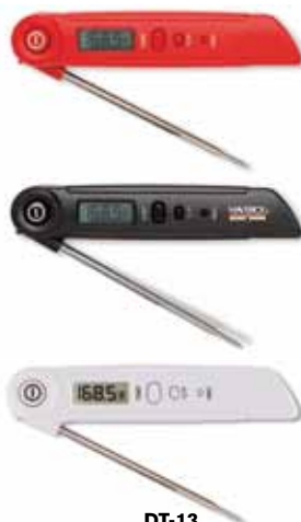
DT-13 FLIP TIP INSTANT READ Available in Red, Black, White +32°F to +572°F / 0°C to +200°C