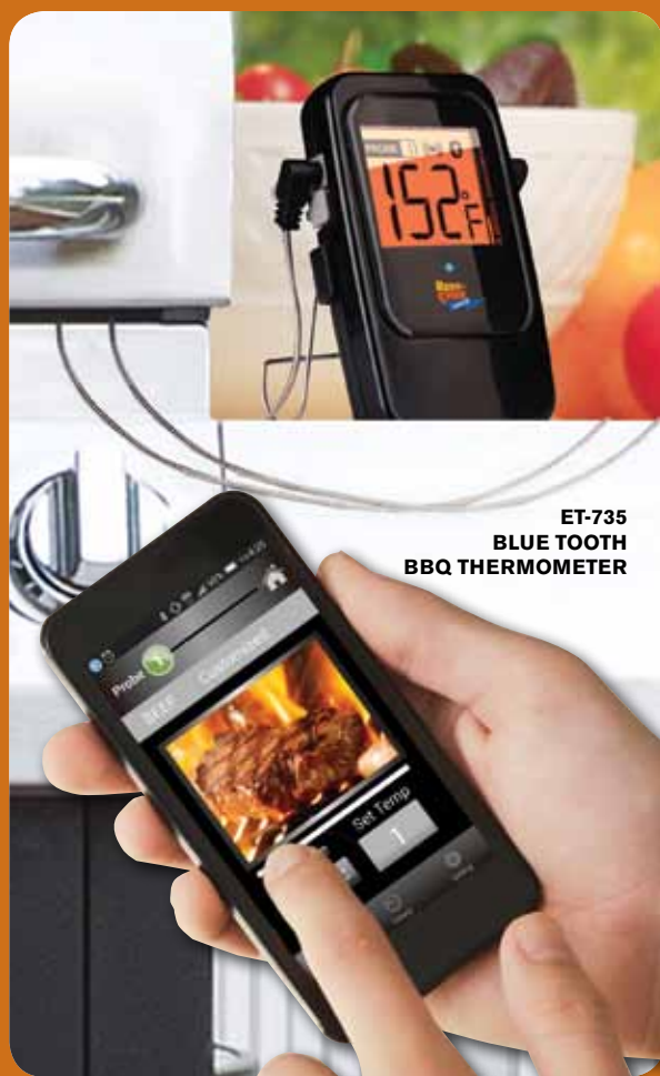
ET-735 BLUE TOOTH BBQ THERMOMETER