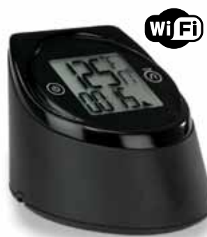
ET-736 WIFI ROASTING THERMOMETER App Driven Thermometer Dual Probes, Recipe Storage Unlimited Timers