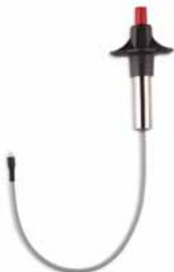
BL-02 PIEZO LIGHTER WITH FLEXIBLE TIP