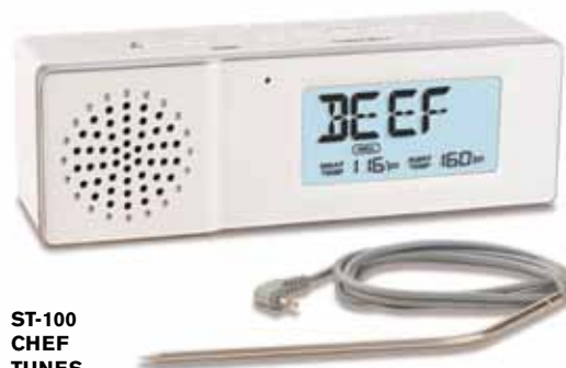
ST-100 CHEF TUNES Blue Tooth Speaker, Hands Free Phone & Roasting Thermometer Available in white and black