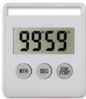
TM-233 PROMOTIONAL DIGITAL SINGLE LINE TIMER 99 Minute, 59 Second Timer