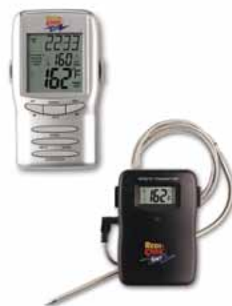
ET-72 SINGLE PROBE REMOTE 100 Ft Range Timer Includes Pre-Select Meat and Taste +14°F to +410°F / -10°C to +210°C