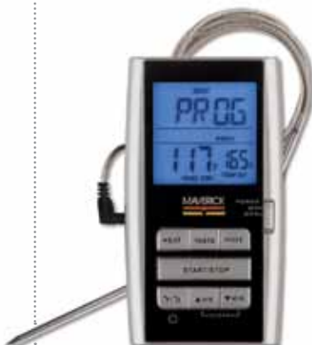
ET-8 DIGITAL SINGLE PROBE ROAST ALERT Timer Included Meat and Taste Selection +32°F to +212°F / 0°C to +100°C