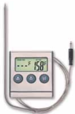
ET-808C DIGITAL ROASTING THERMOMETER Timer Included +32°F to +482°F / 0°C to +200°C