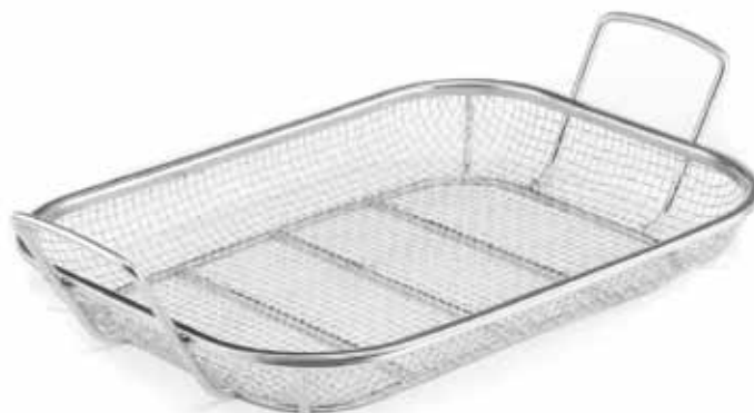
MRP-01C STAINLESS STEEL MESH ROASTING PAN