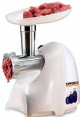
MM-5501 DELUXE MEAT GRINDER Reversible Motor / 550 Watts Auto Reset