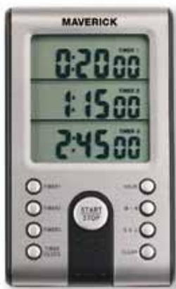
TM-03 THREE LINE DIGITAL TIMER Count Down/Count Up 99 Minute, 59 Second Timer