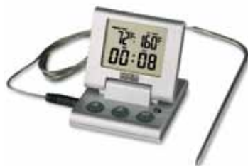
ET-807C FLIP UP DIGITAL ROASTING Timer Included +32°F to +482°F / 0°C to +200°C