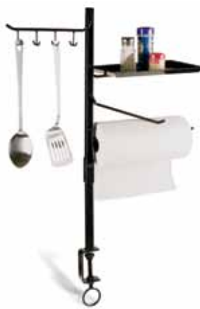
AO-01 BBQ ACCESSORY ORGANIZER