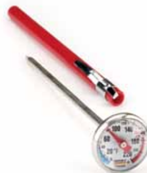
IRT-01 INSTANT READ 1" DIAL WITH SLEEVE 0°F to +220°F / -10°C to +100°C