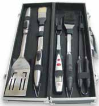
AK-01 BBQ ACCESSORY KIT WITH DIGITAL FORK IN CASE