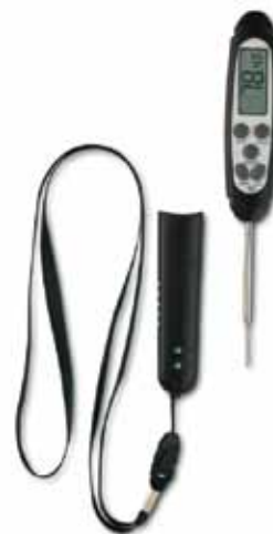
DT-09C FAST READ DIGITAL PROBE Handle and Protective Sleeve Waterproof • 1.7mm Tip -58°F to +572°F / -58°C to +300°C Also available in red