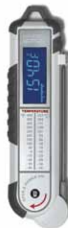
PT-100 PROFESSIONAL THERMOCOUPLE THERMOMETER Large LCD Display • Waterproof • Shockproof -40°F to +450°F / -40°C to +232°C