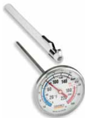
IRT-02 LARGE DIAL INSTANT READ 2" DIAL WITH SLEEVE 0°F to +220°F / -10°C to +100°C