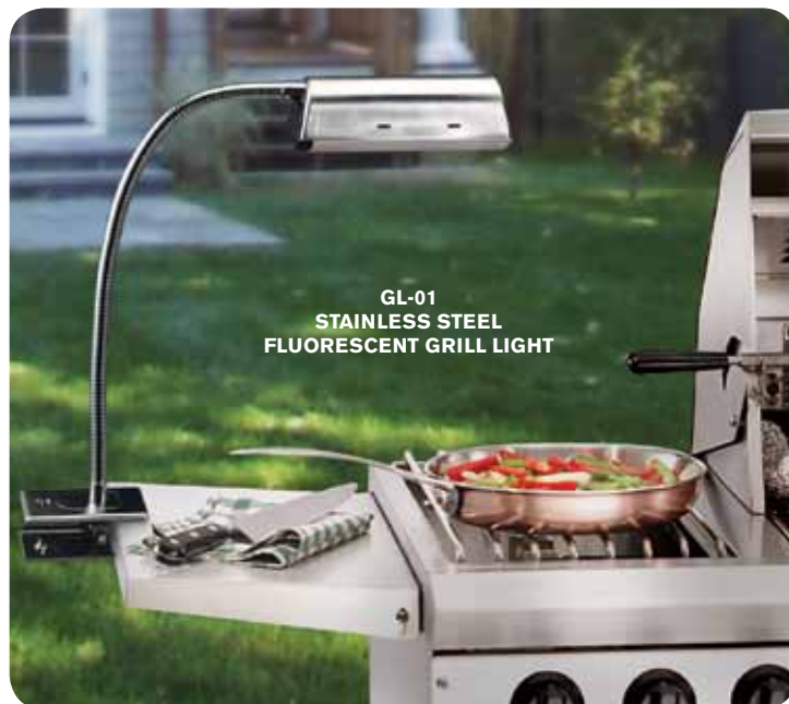
GL-01 STAINLESS STEEL FLUORESCENT GRILL LIGHT