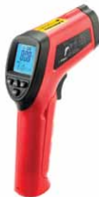
LT-04 LASER INFRARED THERMOMETER Accurate up to 5 Feet -44°F to +1022°F / -42°C to +550°C