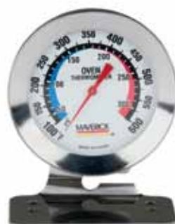
OT-02 LARGE DIAL OVEN THERMOMETER Color Coded Dial +100°F to +600°F / +50°C to +300°C