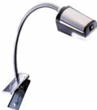
GL-03 18" STAINLESS STEEL 4 LED GRILL LIGHT