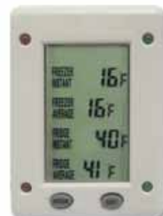
RF-02 DIGITAL REFRIGERATOR/ FREEZER THERMOMETER Computes Average Temperature Refrigerator and Freezer Settings -22°F to +50°F / -30°C to +10°C