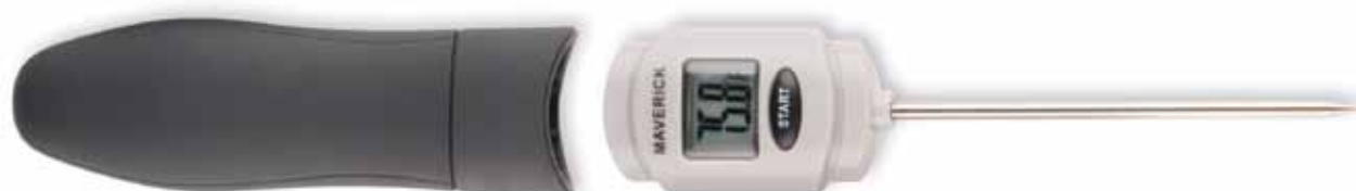
DT-12C POCKET PEN DIGITAL PROBE Cover Doubles as a Handle Fast Calculation Probe +32°F to +212°F / 0°C to +100°C