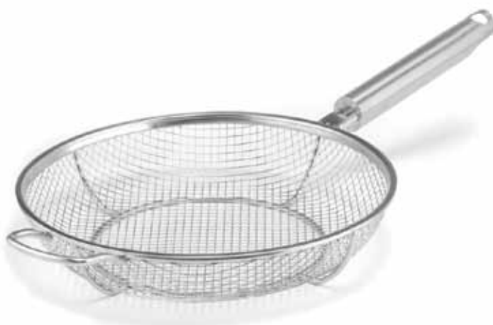
MFP-01CR STAINLESS STEEL MESH FRY PAN Removable Handle