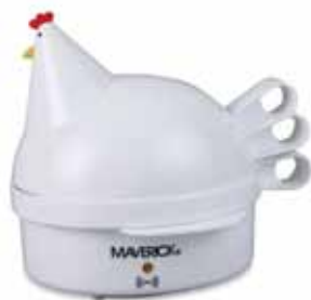
SEC-2 HENRIETTA HEN EGG COOKER Soft, Medium or Hard Boils up to Seven Eggs Poaching Tray for Four Eggs Chirps when Eggs are Ready