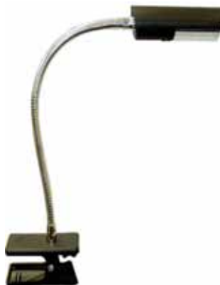
GL-05C 12" 4 LED BASIC GRILL LIGHT