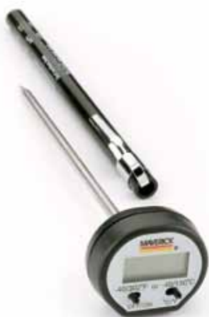
DT-01 CHEF'S DIGITAL INSTANT READ Protective Pocket Sleeve Included -50°F to +392°F / -45°C to +200°C