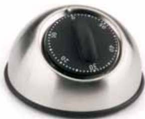
TM-07C STAINLESS STEEL MECHANICAL TIMER 60 Minute Timer