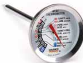
RT-03 GOURMET ROASTING THERMOMETER Large Color Coded Dial +130°F to +190°F / +54°C to +90°C