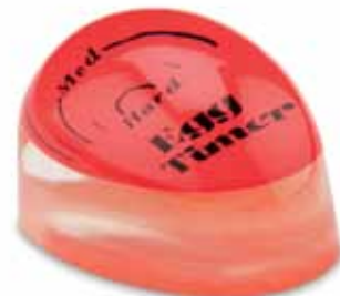
TM-100 IN WATER EGG TIMER