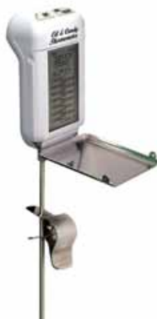
CT-03 DIGITAL CANDY/DEEP FRY 14 Pre-Programmed Settings +32°F to +392°F / +0°C to +200°C