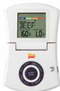
ET-88 PROMOTIONAL DIGITAL ROAST Meat Selection +32°F to +212°F / 0°C to +100°C