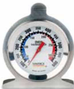
OT-01 OVEN THERMOMETER Color Coded Dial +100°F to +600°F / +50°C to +300°C