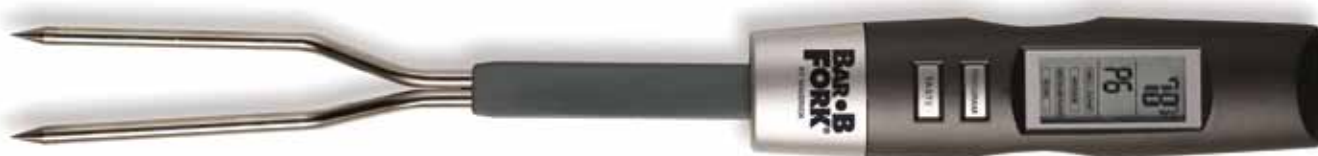
ET-54 PROMOTIONAL BARBECUE FORK Shows Temperature +32°F to +212°F / 0°C to +100°C