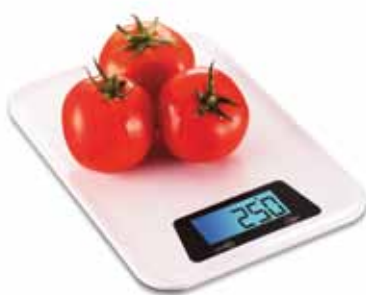
KS-02 KITCHEN SCALE Measures Fluid Ounces 7 lbs. Capacity