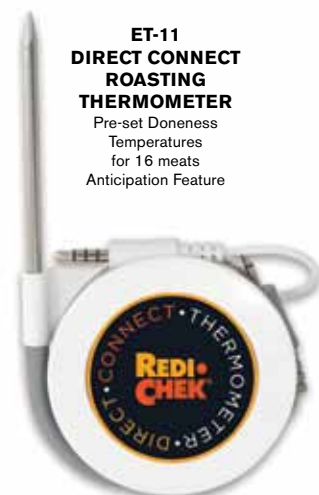
ET-11 DIRECT CONNECT ROASTING THERMOMETER Pre-set Doneness Temperatures for 16 meats Anticipation Feature