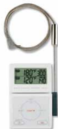
ET-85 DUAL PROBE OVEN/ROAST TWO IN ONE THERMOMETER Alerts for Both Food Temperature and Oven Temperature +32°F to +572°F / 0°C to +300°C