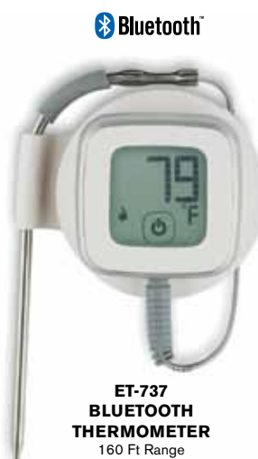
ET-737 BLUETOOTH THERMOMETER 160 Ft Range Easy Storage