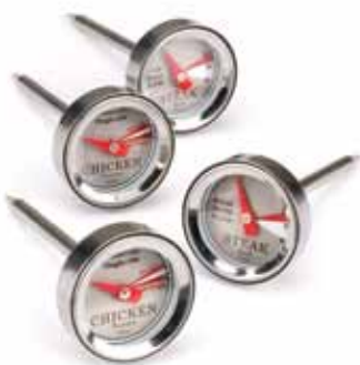
RT-04 SET OF FOUR STEAK & CHICKEN MINI THERMOMETERS