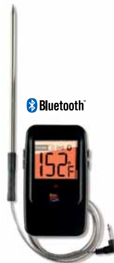
ET-735 BLUE TOOTH BBQ THERMOMETER 160 Foot Range 2 Hybrid Water-Proof Probes