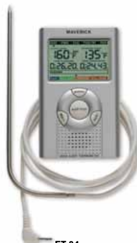
ET-84 DIGITAL ROAST ALERT PROBE Voice Alert and Anticipation Feature Timer Included Switch Between Two Foods +32°F to +212°F / 0°C to +100°C