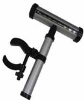
GL-200C HANDLE MOUNT 8 LED GRILL LIGHT With On / Off and Tilt Switches