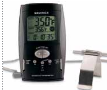
OT-3BBQ DIGITAL BARBECUE THERMOMETER LCD Shows Grill Temperature +122°F to +572°F / +50°C to +300°C