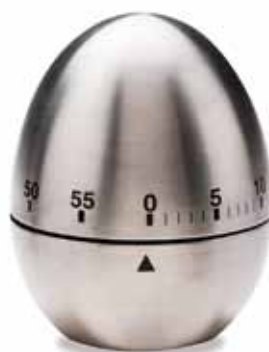
TM-705 STAINLESS STEEL EGG TIMER 60 Minute Timer