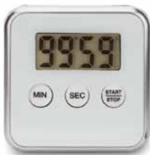
TM-231 SINGLE LINE DIGITAL TIMER 99 Minute, 59 Second Timer Available in Five Colors