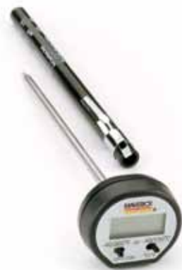
DT-01 CHEF'S DIGITAL INSTANT READ Protective Pocket Sleeve Included -50°F to +392°F / -45°C to +200°C