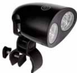
GL-320 10 LED GRILL LIGHT