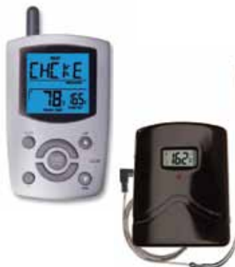
ET-706 COLOR CHANGING LCD Presets for Meat and Taste Timer included +14°F to +410°F / -10°C to +210°C