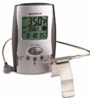
OT-03 DIGITAL OVEN THERMOMETER Computes Average Oven Temperature +122°F to +572°F / +50°C to +300°C