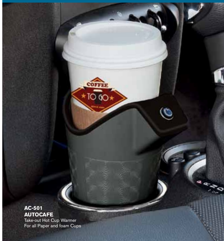
AC-501 AUTOCAFE Take-out Hot Cup Warmer For all Paper and foam Cups