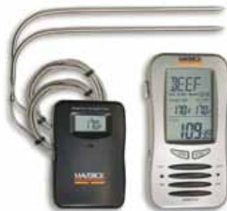
ET-7 DUAL REMOTE THERMOMETER Two Timers • Two Probes Monitor Two Meats at the Same Time +14°F to +410°F / -10°C to +210°C