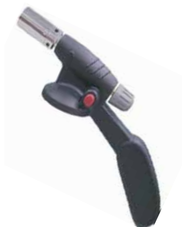
PL-8032C PROPANE TORCH Works with US 1" Thread Propane Gas Cylinder Easy Grip Handle