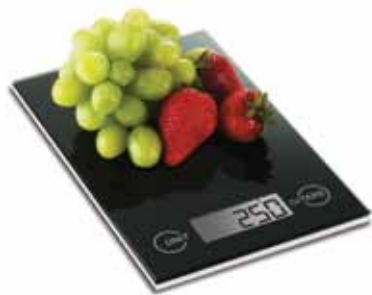
KS-03 KITCHEN SCALE Tempered Glass Top 11 lbs. Capacity