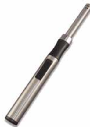
BL-01 BBQ LIGHTER Refillable Butane Tip Extends from 1.5" to 2.75"