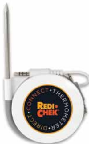
ET-11 DIRECT CONNECT ROASTING THERMOMETER Pre-set Doneness Temperatures for 16 meats Anticipation Feature