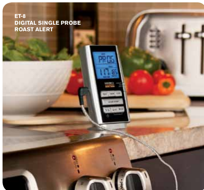
ET-8 DIGITAL SINGLE PROBE ROAST ALERT