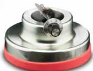
TTT-01 TIP TOP TEMP Perfect for Low and Slow Cooking Automatically Regulates the Temperature