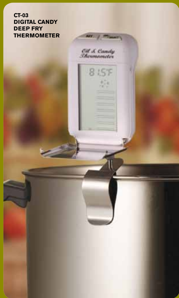
CT-03 DIGITAL CANDY DEEP FRY THERMOMETER