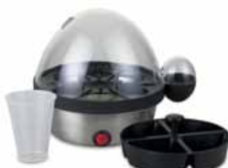
EC-200 STAINLESS STEEL EGG COOKER Soft, Medium or Hard Boils up to Seven Eggs Measuring Cup Included Poaching Tray for Four Eggs