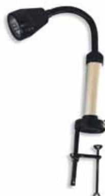
GL-400C 18 LED GRILL LIGHT