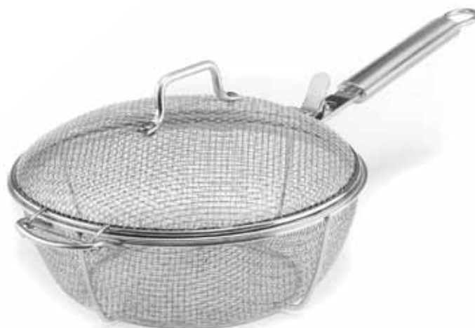
MGP-01CR STAINLESS STEEL MESH CHEF'S PAN WITH LID