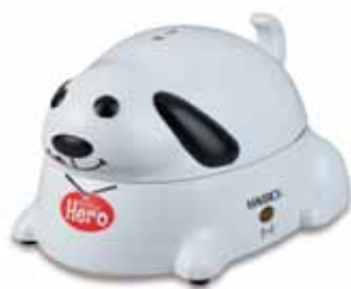
HC-01 HERO HOT DOG STEAMER Cooks up to Seven Hot Dogs Dog Barks when Hot Dogs are Ready