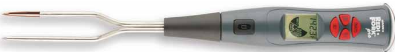
ET-68 REDIFORK PRO Fork Thermometer with Detachable Tines Cooking Chart on LCD +32°F to +212°F / 0°C to +100°C