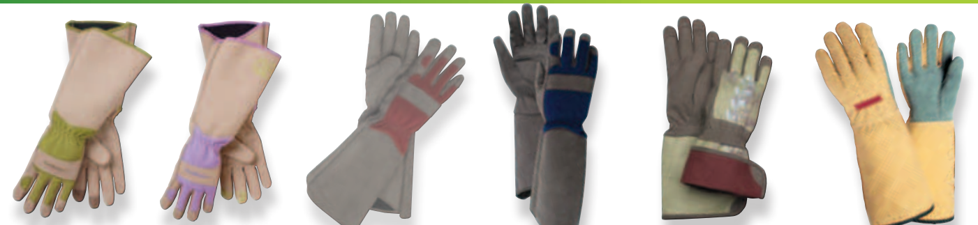
BE194T MEN BE195T TE195T TE194T MEN TE296T G190T