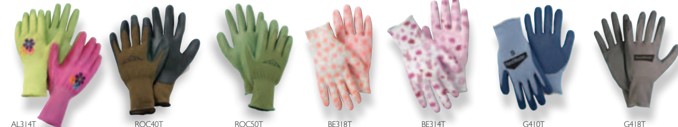
AL314T ROC40T MEN ROC50T BE318T BE314T G410T G418T MEN