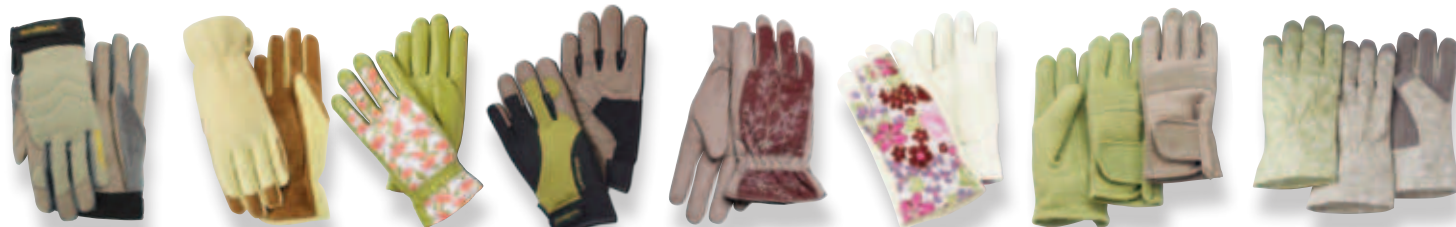
PGP55T PGP50T BE268T BE267T MEN TE266T GC264T GC164T G162T