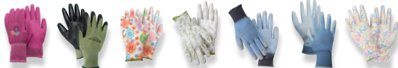
AL5000T ROC60T AL319T BE319T G420T G215T G219T