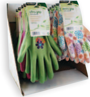
PEGGED SHELF DISPLAY Holds 1-2 dozen pairs garden gloves. Set up dimensions: Ht: 12" x W: 11" x D: 8.25" Shipper: Ht: 12.25" x W: 11.25" x D: 8.5" Floor Space .63 sq. ft. PDQ