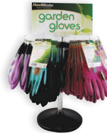
COUNTER SPINNER Holds 3-6 dozen pairs garden gloves. Set-up dimensions: Ht: 23" (with header) x W: 14.75" x D: 14.75" Shipper: Ht: 2.75" x W: 12" x D: 15" Counter Space 1.5 sq. ft. CNTRSPNR