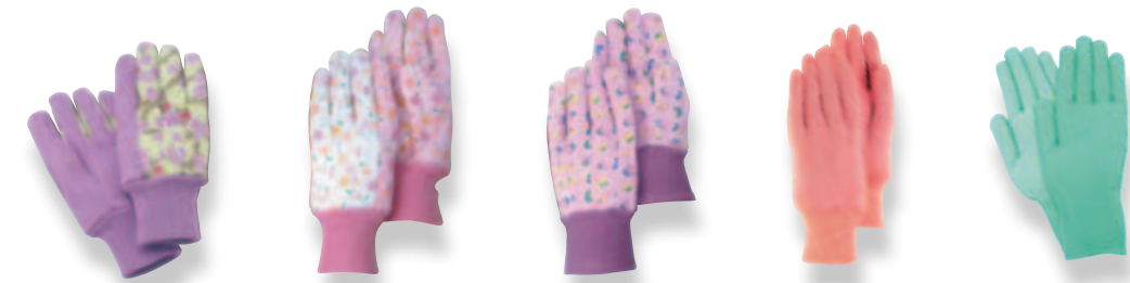
GC184T G180T G120T T129CT G115T