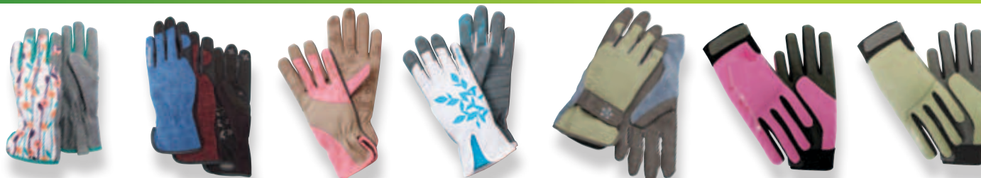
AL168T PGP60T BE168T BE288T TE166T BC251VT G251VT

The HandMaster® fashion collections mix and match easily – in design, color and packaging. Choose your favorite coating, fabric or leather glove by category... and put together an assortment that meets your customers' needs.