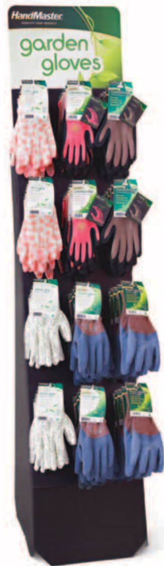
POWER WING Holds 6-12 dozen pairs assorted garden gloves. Set-up dimensions: Ht: 63" x W: 14" x D: 15" Shipper: Ht: 50" x W: 14" x D: 6" Floor Space 1.5 sq. ft. NPWB