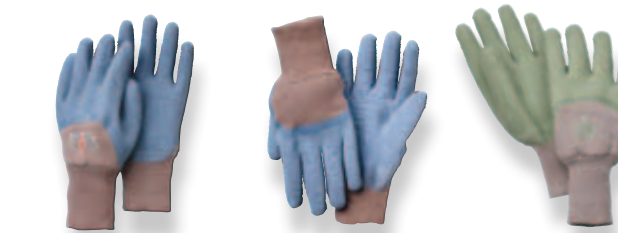
BE198T BE197T MEN TE196T