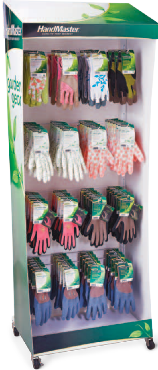
OUTDOOR MERCHANDISER Holds up to 16 dozen pairs assorted garden gloves. Sturdy wheels for easy mobility inside or outdoors. Set up dimensions: Ht: 70" x W: 25.25" x D: 15.5" Shipping dimensions: 2 Boxes; Ht: 69" x W: 27" x D: 3" (15 lbs.) and Ht: 26" x W: 12" x D: 6" (5 lbs.) Carton of gloves (shipped separately): Ht: 22.5" x W: 17" x D: 11.5" (25 lbs.) GLOVESTATN