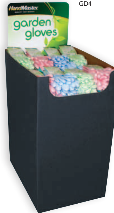
DUMP DISPLAY Holds 6-12 dozen pairs garden gloves. Set-up dimensions: Ht: 30"(39.5" with header) x W: 15.5" x D: 21.5" Shipper: Ht: 31" x W: 16" x D: 22.5" Floor Space: 2.5 sq. ft. HMDB