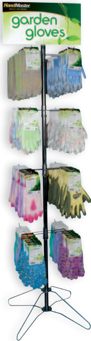
REVOLVING FLOOR DISPLAY Holds 16 dozen pairs assorted garden gloves. Set-up dimensions: Ht: 65" x W: 18" x D: 18" Shipper: Ht: 29" x W: 12" x D: 17" Floor Space 2.2 sq. ft. GD16