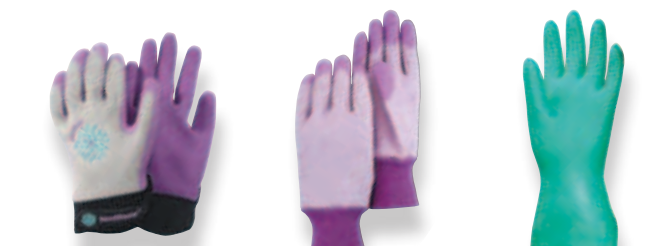
AL3000T G330T GF18T