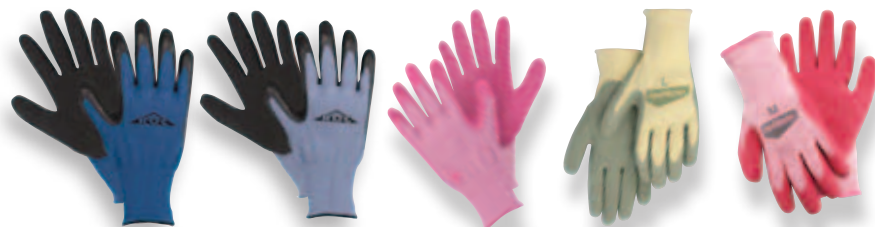
ROC45T MEN ROC55T BC55T G316T G416T