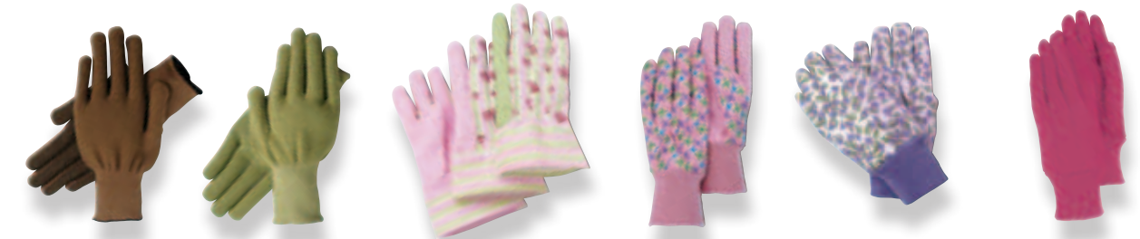
G117T MEN G118T GC134T G103T BE188T BC92CPT