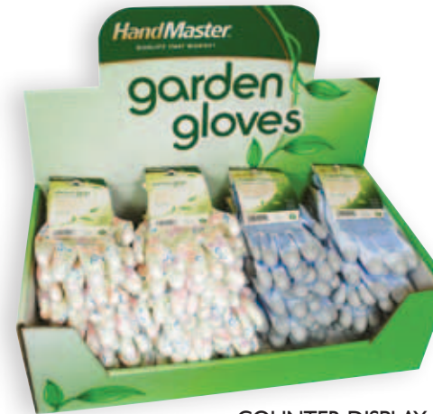
COUNTER DISPLAY Holds 2-4 dozen pairs garden gloves. Set-up dimensions: Ht: 14" x W: 18" x D: 10" Shipper: Ht: 6" x W: 19" x D: 11" Counter Space: 1.2 sq. ft. GD4