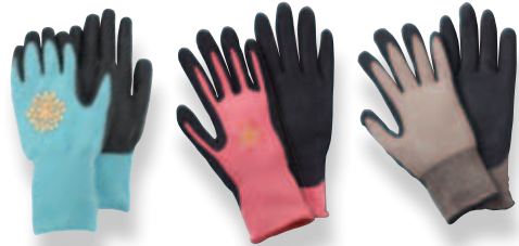
AL338T BE338T BE337T MEN