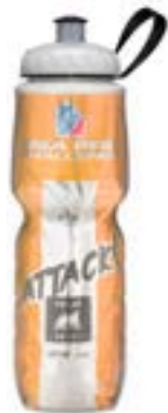
Orange Aggressive Rider Jersey