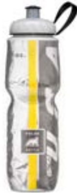
Black and Yellow