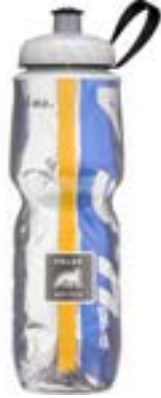
Gold and Blue