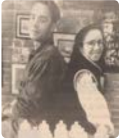
Boulder Daily Camera, March 1996

In 1994, Polar Bottle was founded as a family company in a Boulder, Colorado garage. We had a simple vision: to offer people the delight of a cool, pure, drink of water – anywhere. As the original insulated water bottle, Polar Bottle found an early following among athletes in the biking and outdoor communities.