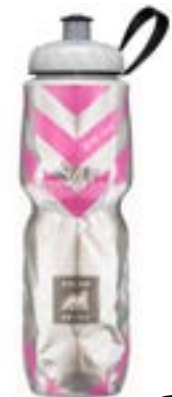
Pink Chevron NEW