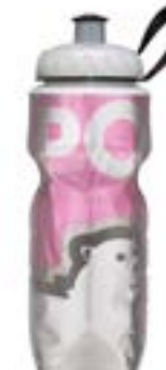
Pink Bear Only available in 20oz