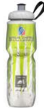
Green Sprinter Jersey