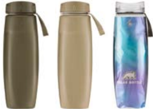
Stealth Olive Stealth Desert Deep Ocean Available in 2016

CENOTE HYDRATION SYSTEM with 4 disposable reservoirs