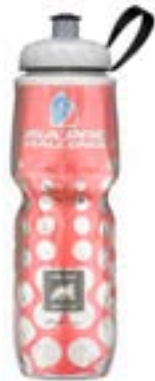
Red Dot King of the Mountains Jersey