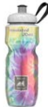
* Tie Dye Rainbow