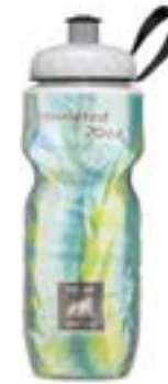
* Tie Dye Surf