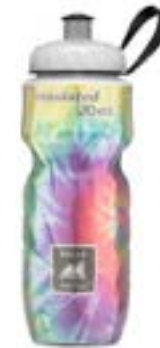
Tie Dye Rainbow

We take great pride in the quality of each and every Polar Bottle water bottle. Our products are designed to be used for years. They pass through many rigorous quality control checks before leaving our warehouse. We understand that things happen; bottles break or customers are simply unsatisfied. To ensure unparalleled customer service and protect the planet, we offer retailers and consumers an unconditional lifetime guarantee on all of our products. This includes a replacement cap service. Consumers shouldn't have to replace a perfectly good bottle just because they damaged the cap. Just give us a call or drop us an email and we will take care of it. Guaranteed.