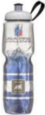
Best CO Rider