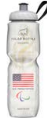
US Paralympic Team Flame