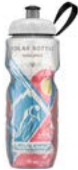
2015 Commemorative 20 oz