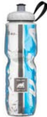
Light Blue and Black