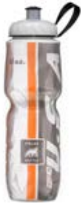
Orange and Black