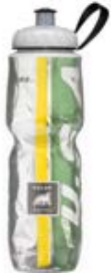
Green and Yellow