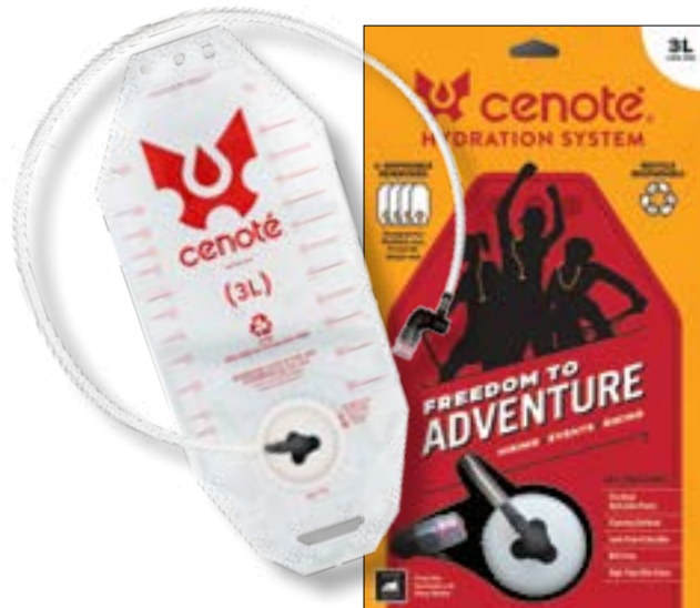
Cenote Hydration System Available in 3L & 2L

CENOTE HYDRATION SYSTEM with 4 disposable reservoirs