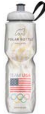
Team USA Flame