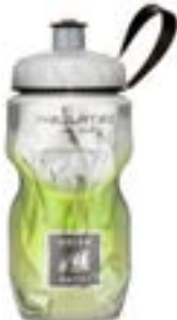
Green Fade Only available in 12oz