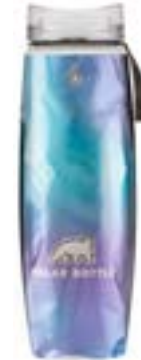
Deep Ocean Available in 2016