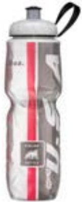
Red and Black