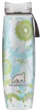
Oh Happy Day

2015 Styles are recommended for warm and cold liquids