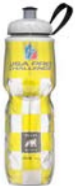
Yellow Leader Jersey