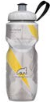
Yellow Pattern Only available in 20oz