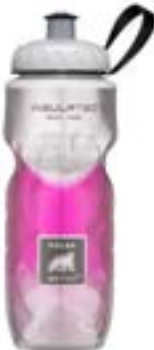
Pink Fade Only available in 20oz