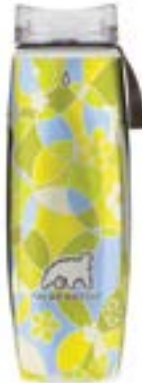
Circles and Flowers