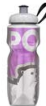
Purple Bear Only available in 20oz