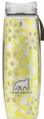
Silver and Gold