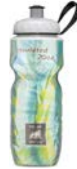
Tie Dye Surf