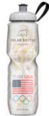
Team USA Flame

Polar Bottle is proud to be an official water bottle licensee of the United States Olympic and Paralympic Teams. For every Team USA Polar Bottle sold, a portion of the proceeds goes directly to support Olympic and Paralympic athletes across the United States as they prepare for the 2016 Summer Games in Rio de Janeiro, Brazil. With our special edition Team USA Polar Bottle, your business can tap into the growing excitement for next year's Olympic Games, and help support Team USA athletes on the Road to Rio.