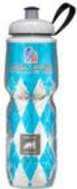
Blue Best Young Rider Jersey