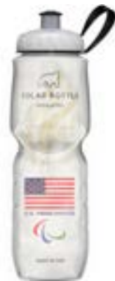
US Paralympic Team Flame