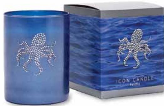
Octopus / CIBOCTO ◆ Cool water clean with berries and pine