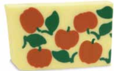
Pumpkin Patch ▲ Buttery citrus and a handful of spices, cinnamon, nutmeg and clove create a fresh baked aroma. SLPUM / SCPUM / SWPUM