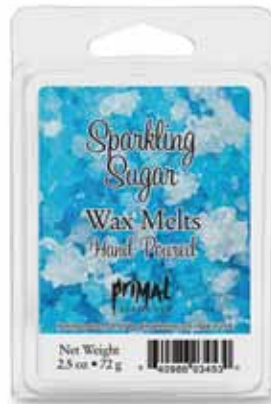
Sparkling Sugar / WAXSS 🍬