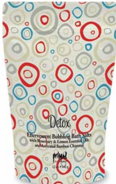
Detox Bubbling Bath Salts / BBSDETOX ● Rosemary and lemon essential oils along with bamboo charcoal detoxify and soothe both skin and muscles.