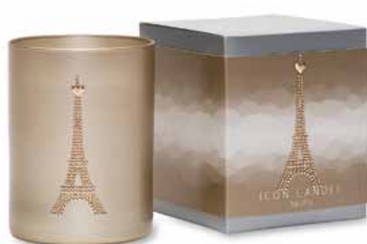
J'aime Paris / CIGJP ★ Romantic orchid, violet and blackberry musk