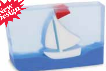
Toy Boat ★ Say that fast five times! Sail away in fresh and clean notes of sea spray and sea salt. SLTOYB / SCTOYB / SWTOYB