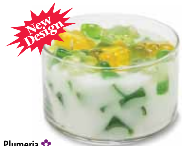
Plumeria 🌸 Plumeria Blossom wrapped in notes of jasmine, peach and citrus. CBPLU