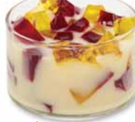
Tahitian Vanilla ▲ The sultry scent of sweet and creamy vanilla. CBTV