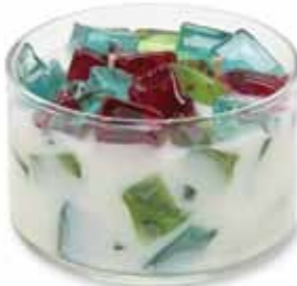
Mistletoe ◆ A fragrant kiss of holiday greens. CBMIST