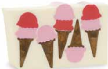
Waffle Cones ▲ Get the scoop of sweet and creamy vanilla goodness. SLWAF / SCWAF / SWWAF