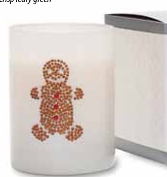
Gingerbread Man / CIWGBM ▲ Fresh baked gingerbread