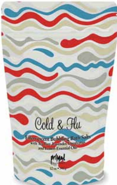
Cold & Flu Bubbling Bath Salts / BBSOLD ● Tea Tree, Lavender, Eucalyptus and Lemon essential oils pack a powerful punch when you are under the weather and need to get over it.