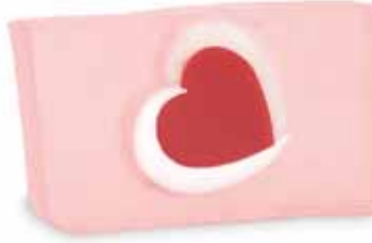
Cherish ✕ The juicy aroma of mixed berries enveloped in sweet vanilla will surely please the one you cherish. SLCH / SCCH / SWCH