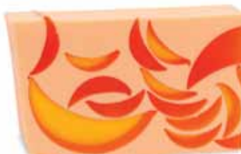
Orange Cantaloupe ✕ Sweet cantaloupe with a twist of orange combine for tangy refreshment. SLOC / SCOC / SWOC