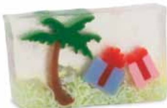
Christmas in Paradise ✕ A holiday vacation escape is yours with this festive bar featuring the luscious aroma of banana, coconut and pineapple. SLCIP / SCCIP / SWCIP