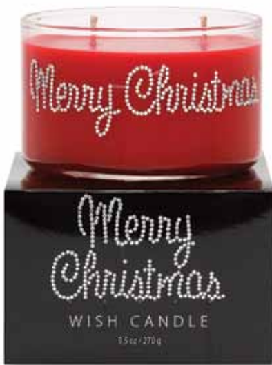
Merry Christmas / WCMC ✨ A potpourri of orange, clove, nutmeg and spice