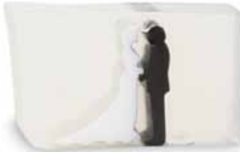
Holy Matrimony ★ Juicy strawberries and a bit of the bubbly propose a toast to the bride and groom. SLHM / SCHM / SWHM