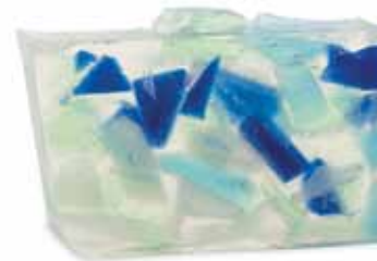
Beach Glass ◆ Bergamot, grapefruit, water lilies and fresh seaweed carry you to the breezy seashore. SLBE / SCBE / SWBE