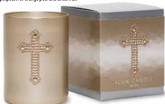
Cross / CIGCROSS ❁ Cashmere and amber