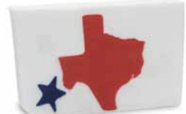
Texas ◆ Clean up the Lone Star State! Yellow roses and summer melons round out the fragrance. SLTX / SCTX / SWTX