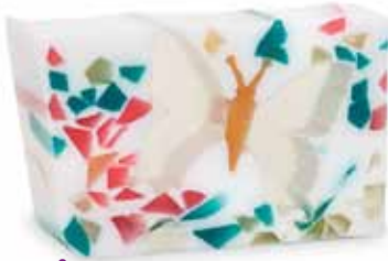
Butterfly ✿ In a field of florals, a fresh citrus bouquet flutters around a woody musk dry down. SLBF / SCBF / SWBF