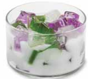
Lavender ● The soothing aroma of lavender essential oil CBLEO