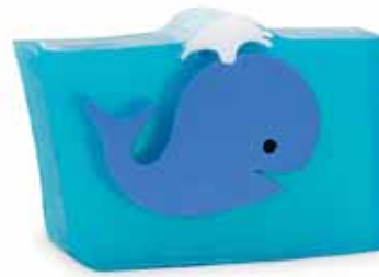
Blue Whale ✂ Fruity freshness for tons of bath time fun! SLBW / SCBW / SWBW