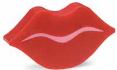
S.W.A.K. ★ Exotic floral blend of jasmine, muguet, and Casis, with sparkling citrus top notes all sealed with a kiss. SLSWAK / SCSWAK / SWSWAK