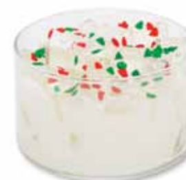
Santa's Cookies ▲ Warm cookies with a hint of nutty spice. CBSC