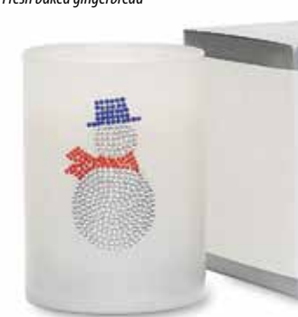
Snowy / CIWSN ◆ Frosty citrus and lily