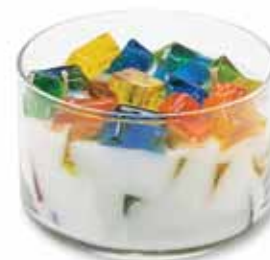
Pineapple Rum Splash ✨ A blend of island pineapple and creamy vanilla wrapped in dark rum. CBPRS