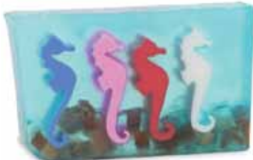
A Day at the Races ◆ The cool notes of sea-spray and salt wrapped in a breezy beach accord. SLSH / SCSH / SWSH