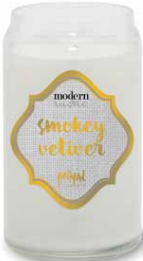
Smokey Vetiver ❖ Amber, oak, vetiver and moss. MRCSV