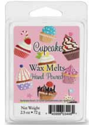
Cupcake / WAXCUP 🍰