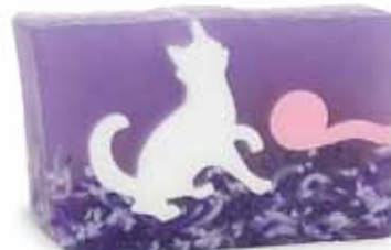
White Cat Soap ✕ Our furry feline plays in a bar of fresh berries. SLWC / SCWC / SWWC