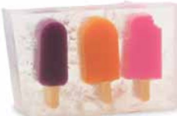
Juice Pops ✕ Juicy papaya, fresh tropical berries plus a hint of pineapple and peach make this a summertime treat. SLPOP / SCPOP / SWPOP