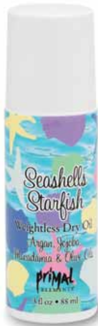
Seashells & Starfish / DOROSSSF ✨