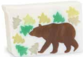
Ginger Bear ▲ Experience the scrumptious fragrance of warm gingerbread straight from the oven. SLGB / SCGB / SWGB