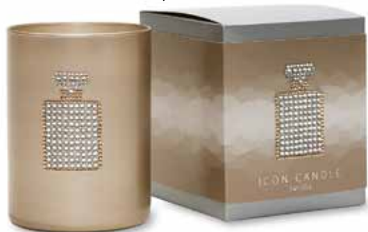
Perfume Bottle / CIGPB ❁ Romantic floral heart, juicy citrus and musk