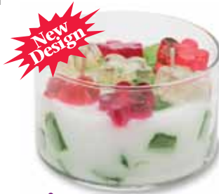
Flowershop 🌸 A fragrant bouquet of leafy florals with a base of moss and clove. CBFL