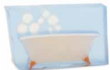
Bubble Bath ★ Fresh fruitiness drifts among relaxing bubbles of woody floral notes. SLBUB / SCBUB / SWBUB