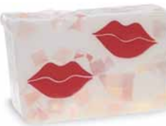
Smooches ★ Bathe in kisses with this romantic champagne and strawberries bar. D418,941 SLXOS / SCXOS / SWXOS