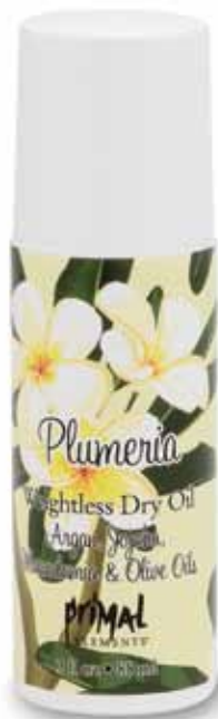
Plumeria / DOROPLU 🌸