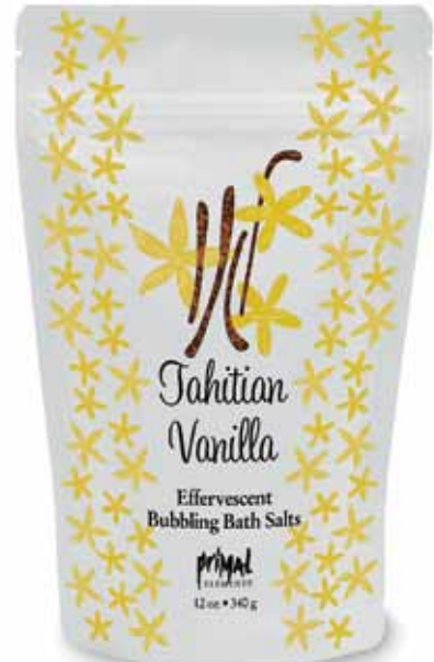
Tahitian Vanilla Bubbling Bath Salts / BBSTV ▲ The sultry scent of sweet and creamy vanilla.