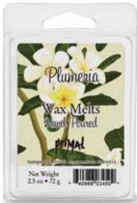
Plumeria / WAXPLU 🌺