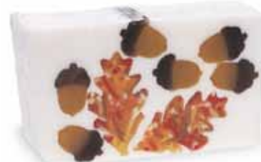
Winterfall ✨ Autumn foliage and warm nutty acorns tucked inside a bar of herbal green notes and rich woods. SLWF / SCWF / SWWF