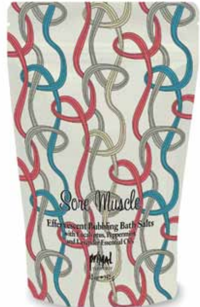
Sore Muscle Bubbling Bath Salts / BBSORE ● Eucalyptus, lavender and peppermint essential oils ease sore muscles and aid for a relaxing, soothing soak.