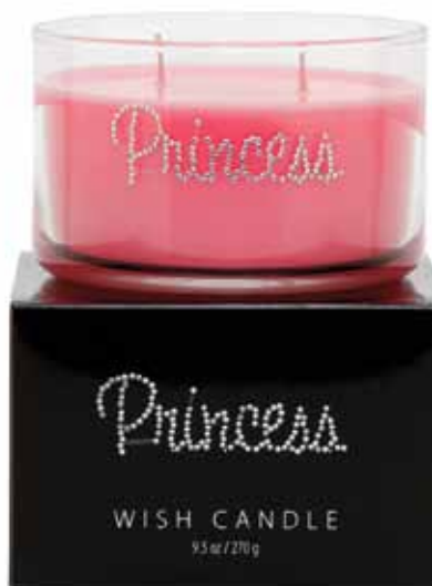
Princess / WCPRI ★ Lavish notes of jasmine and hyacinth with a hint of sweet citrus