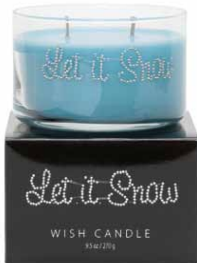
Let it Snow / WCLIS ◆ A delicate blend of fragrant citrus and powdery sugar