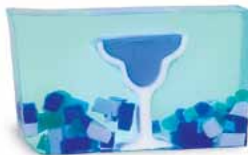
Blue Margarita ✨ Please pass the salt! Icy citrus notes of lemon, lime and a splash of orange. SLBM / SCBM / SWBM