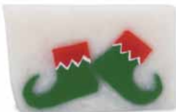
Elf Shoes ★ A bubbly blend of effervescent champagne and bright citrus. SLELF / SELF / SWELF