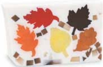
Autumn Leaves ▲ The colors of fall wrapped in a fragrant blanket of roasted chestnuts. SLAUT / SCAUT / SWAUT