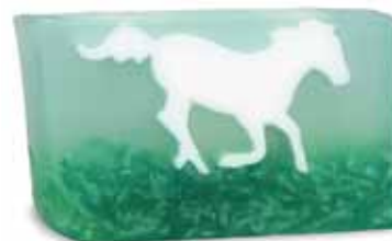
Mustang Sally ✧ A wild mix of bergamot, lime and sandalwood. SLMUST / SCMUST / SWMUST