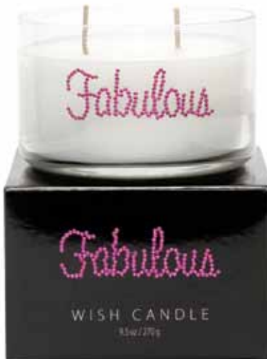
Fabulous / WCFAB ▲ Decadent delight with notes of praline, crisp apple and pear