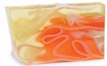
Grapefruit ★ An invigorating burst of tart citrus. SLGRA / SCGRA / SWGRA