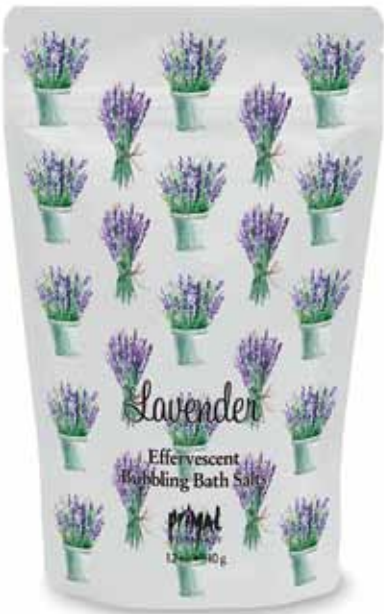
Lavender Bubbling Bath Salts / BBSLEO ● The soothing aroma of lavender essential oil.