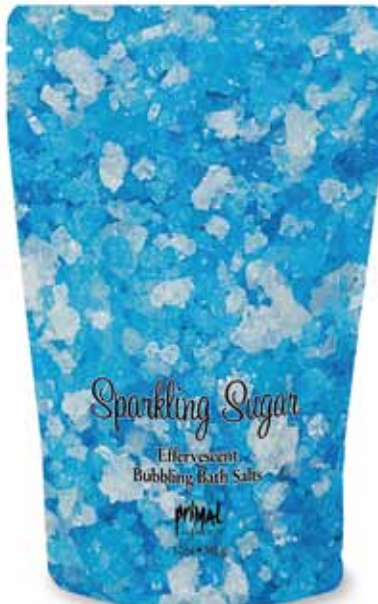
Sparkling Sugar Bubbling Bath Salts / BBSSS ▲ This fragrance is a decadent delight of sweet spun sugar with a dusting of caramel and vanilla.