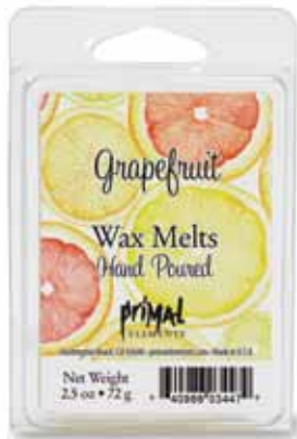
Grapefruit / WAXGRA 🍊