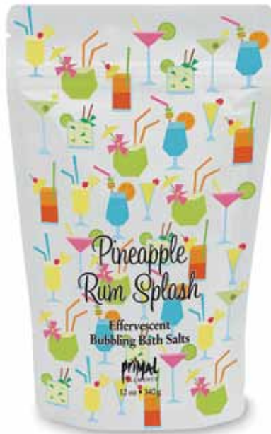
Pineapple Rum Splash Bubbling Bath Salts / BBSPRS ✨ A blend of island pineapple and creamy vanilla wrapped in dark rum.