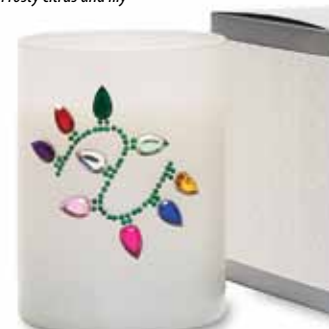
Xmas Lights / CIWXL ✕ Warm apples, pastry and spice