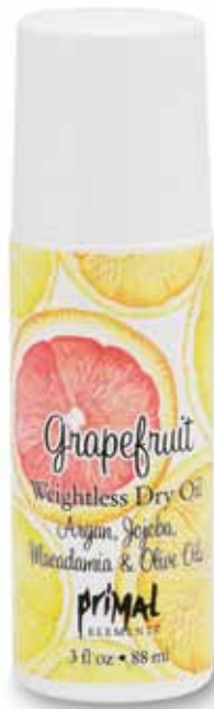
Grapefruit / DOROGRA ✨