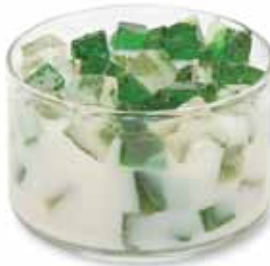
Holiday ▲ Orange peel and dried fruit are intertwined with the rich spiciness of nutmeg, clove and cinnamon. CBXMAS