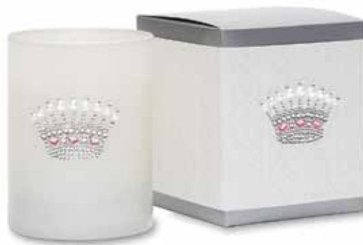
Crown / CIWCROWN ★ Apricot, lily and musk