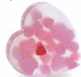
Heart of Hearts ★ Sandalwood and rich musk combined with fruity floral refreshment for one big love of soap. SLHOH / SCHOH / SWHOH