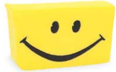
Happy Face ★ A long lasting smile with a citrusy, lemon attitude. SLHF / SCHF / SWHF