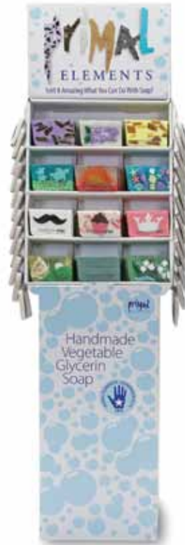
Everyday Shipper 6 Bars of each: Cupcake, Dead Sea Mud, Lavender, Lemongrass & Cranberry Seeds, Lilac, Lily of the Valley, Majesty, Mustache, Sea Turtles, Seashells & Starfish, Sunrise Sunset, Tahitian Vanilla 24 Soap Keepers™ OK-EVERYDAY