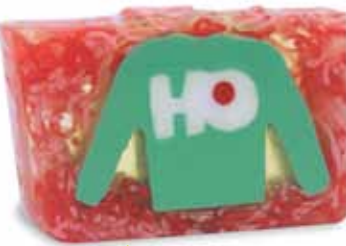
Ugly Xmas Sweater ✕ Lively notes of tart and juicy cranberry and red raspberry mingle with jasmine and magnolia for a holiday bathing treat that is festive and bright. SLUGLY / SCUGLY / SWUGLY 30 Primal Elements Customer Service 1-800-434-8277