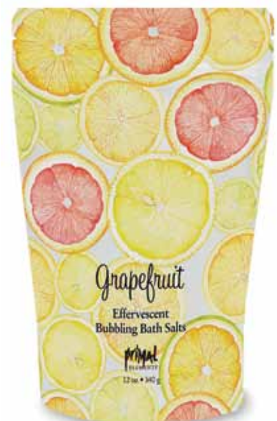
Grapefruit Bubbling Bath Salts / BBSGRA ✨ An invigorating burst of tart citrus.