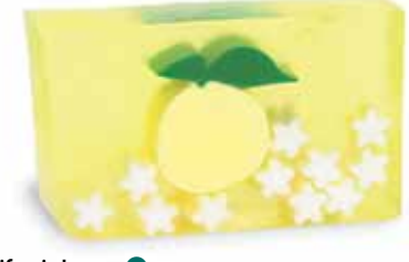
California Lemon ● Sunny California lemon oil provides antiseptic, antibacterial qualities. SLCAL / SCCAL / SWCAL