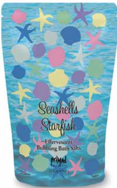
Seashells & Starfish Bubbling Bath Salts / BBSSSF ✨ Watery fresh notes of lemon, geranium, bergamot and mandarin.