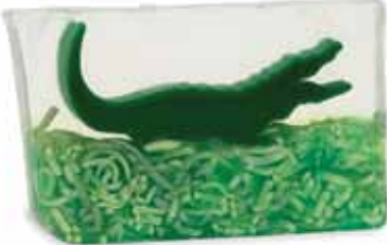
Alligator ✂ Smooth away the scales and enjoy the fragrance of sparkling citrus, juicy melon and fresh mint in this refreshing bar of soap. SLGATOR / SCGATOR / SWGATOR