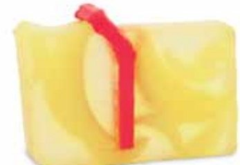
Coconut Water Lemonade Bar ✨ Vitamin and electrolyte rich coconut water enrich this bar for pure hydration from the outside in. SLCWL / SCCWL / SWCWL