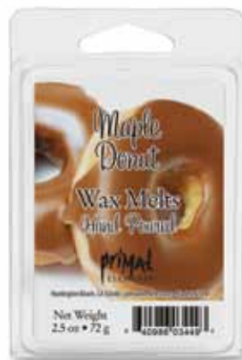
Maple Donut / WAXMD 🍩