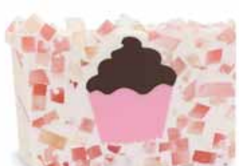
Cupcake ▲ Dreamy and delicious yellow butter cake and frosting. SLCUP / SCCUP / SWCUP