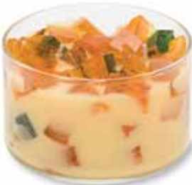
Pumpkin Patch ▲ Buttery citrus, spices, cinnamon, nutmeg and clove create an aroma that smells fresh baked. CBPUM