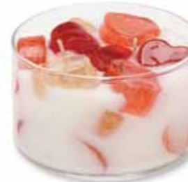
Yes, No, Maybe ✨ Sugary sweetness, just like candy. CBYNM