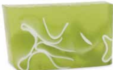
Wheatgrass Juice, Avocado and Lime Detox Bar ● Organic Wheatgrass Juice, Avocado Oil and Lime essential oil detoxify and nourish the skin. No color added, pure and simple. SLWGL / SCWGL / SWWGL