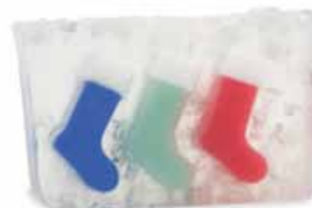
Christmas Stockings ✱ A trio of stockings hanging in a wintry mint bar. SLSTO / SCSTO / SWSTO