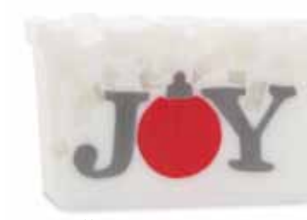
...To The World ✱ Cedarwood, fir balsam, juniper and lavender topped with orange, pine and eucalyptus, this soap will bring you joy. SLJOY / SCJOY / SWJOY