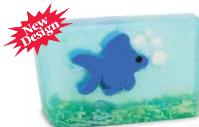
Ginger Fish ◆ A ginger ale scented fish. Lemon and lime intertwine with the effervescent spiciness of ginger. D423,716 SLGF / SCGF / SWGF