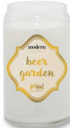
Beer Garden ✨ Lemon, ginger and hops. MRCBG