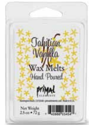
Tahitian Vanilla / WAXTV 🌺