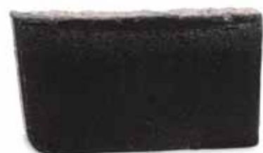
Bamboo Charcoal ✨ Remove toxins and impurities with activated bamboo charcoal while gently exfoliating. Notes of citrus, herb and amber fragrance this jet black bar topped with Himalayan pink salt. SLBAM / SCBAM / SWBAM