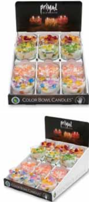
Color Bowl Candle Shipper 12 Color Bowl Candles plus an additional 12 Color Bowl Candles for Backstock OK-CANDLE-24

Twenty Icon Candles are decoratively nestled in our Icon Candle Display Shipper and a box of twenty more for back stock come with this convenient floor stand display. This keeps your Icon Candles neatly in one place for easy viewing by your customers. And finally our countertop Color Bowl Display Shipper holds 12 colorful Color Bowl Candles in a unique display that illustrates the beautiful stained glass effect of these glowing delights. An additional 12 Color Bowl Candles are included for replenishment. Simply pop these shippers out of their cartons and voila! These easy to assemble displays provide a home location for your Primal Elements products.