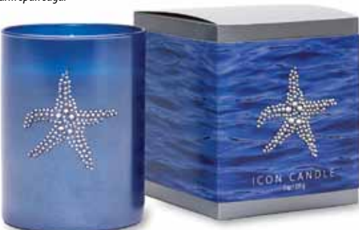
Starfish / CIBSF ◆ Effervescent lemon-lime