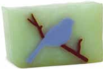
Bluebird ▲ Sweet spun sugar on wings of vanilla cotton candy. SLBLU / SCBLU / SWBLU