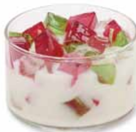
Raspberry Rose ★ Fresh picked raspberries nestled in a bouquet of long stem roses. CBRR