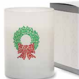
Christmas Wreath / CIWCW Crisp leafy green