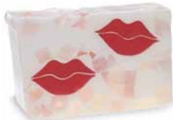
Smooches ★ Bathe in kisses with this romantic champagne and strawberries bar. D418, 941 SLXOS / SCXOS / SWXOS