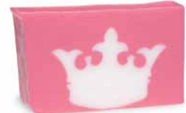
Majesty ✿ A lavish aroma with notes of jasmine, ylang ylang and hyacinth and just a hint of sweet citrus. SLMJ / SCMJ / SWMJ