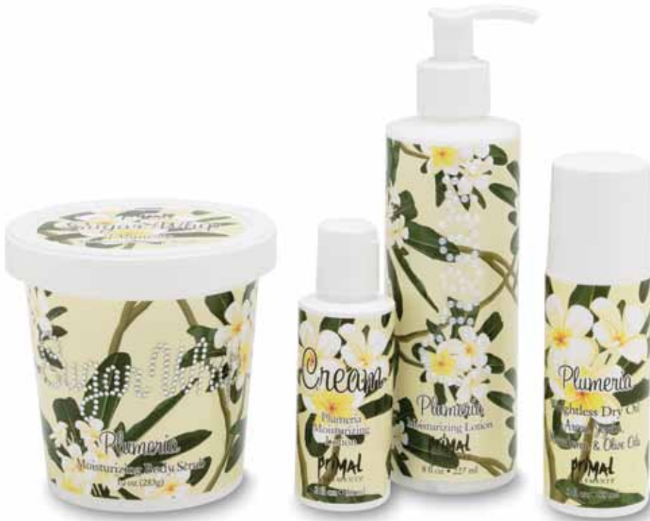
Sugar Whip / BCSWPLU, 2 oz. Moisturizing Lotion / PC2PLU, 8 oz. Moisturizing Lotion / PCPLU, Dry Oil Roll-On / DOR0PLU

Joining our personal care assortment is our beautiful Plumeria Collection. Inspired by the beautiful fabric of a vintage Hawaiian shirt, the eye catching collection is not only beautiful to smell but beautiful to behold as well. The intoxicating aroma is exotic with notes of jasmine, and peach all wrapped in a summer breeze of delicate citrus. Products available in the Plumeria Collection are Sugar Whip , Cream , Effervescent Bubbling Bath Salts and our new Weightless Dry Oil Roll-On Moisturizer .