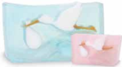
Special Delivery ✿ A sweet bundle of joy wrapped in a powdery fresh scent. SLSTK / SCSTK / SWSTK • SLSTKP / SCSTKP / SWSTKP