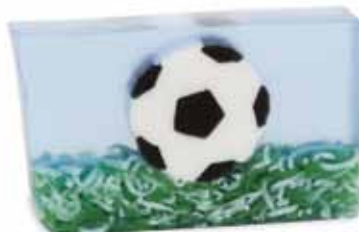
Soccer ◆ The combinations of musk and exotic woods mixed with a splash of citrus will make you yell go-o-o-al. SLS / SCS / SWS