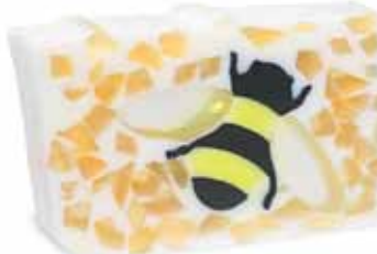
Honey Bee ▲ Real honey buzzes through this orange-honey fragrant bar. SLBEE / SCBEE / SWBEE