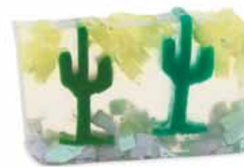
Dos Amigos ★ Fresh sparkling fruits and gentle desert flowers wrap around Saguaro cacti in the pastel painted desert. SLDA / SCDA / SWDA