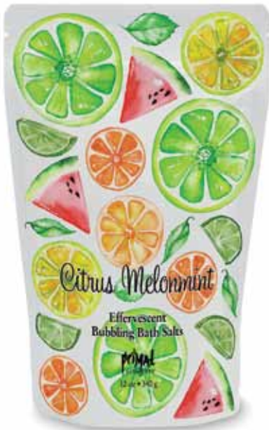
Citrus Melonmint Bubbling Bath Salts / BBSCMM ✨ The fragrance features notes of sparkling fresh citrus with a twist of mint wrapped melon.

What can be more soothing and relaxing than soaking in a tub of rich, creamy bubbles? Enjoy the spa experience of effervescent fragrance as it gently perfumes the bath water and the air with Primal Elements Effervescent Bubbling Bath Salt . Our bubbling blend features mineral-rich salts from the sea and Himalayan pink salt to ease sore muscles and soften the skin. There are two key ingredients that make this soak unique; Citric Acid which creates the effervescent effect and helps release the aroma into the air creating an uplifting aromatic bath and a mild foamer which is derived from coconut oil. This ingredient is a safe and skin friendly cleanser that makes a rich lather without irritation like other ingredients. Available in nine favorite Primal Elements fragrances; Citrus Melonmint , Cupcake , Grapefruit , Lavender , Pineapple Rum Splash , Plumeria , Seashells and Starfish , Sparkling Sugar , and Tahitian Vanilla . Also joining the assortment are Cold and Flu , Detox and Sore Muscles . Each of these blends are perfect pick-me-ups for what ails you. The stand-up pouch features a vent to allow your customers to gently squeeze the bag and smell the product. This pouch is easy to use and offers complete portability making these luxurious bubbles easy to travel with.