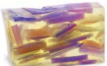
Patchouli ● The distinctive aroma popular in the '60's is back! Pure and uncut, this patchouli is soothing to the soul. SLPA / SCPA / SWPA