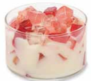
Cherry Vanilla ▲ Tart cherry wrapped in creamy vanilla. CBCV