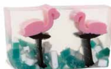
Yardsticks ◆ Classic deco colors, this bar is laced with bergamot, cedar, linden blossom and flamingos. SLYS / SCYS / SWYS