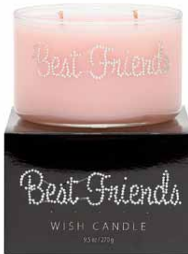
Best Friends / WCBF ★ Bright sunny citrus with a hint of delicate floral