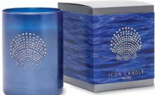
Seashell / CIBSS ▲ Warm spun sugar