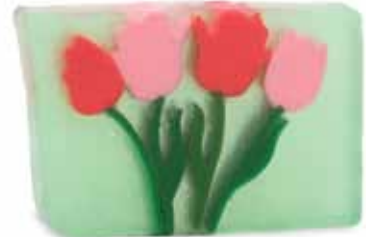
Tulips ✿ An eclectic blend of springtime tulips with notes of tuberose and jasmine. SLTUL / SCTUL / SWTUL