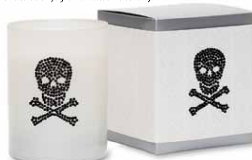
Skull & Bones / CIWSK ▲ Tobacco leaf and vanilla