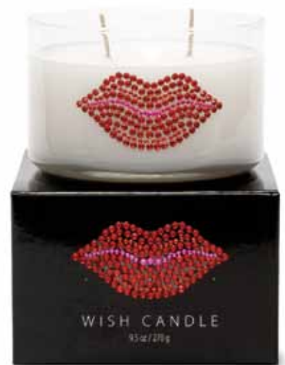
SWAK / WCSWAK ★ Notes of exotic jasmine, muguet and cassia kissed with sparkling citrus