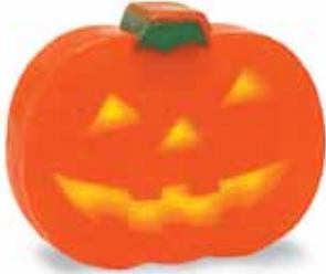
Jack ▲ Field fresh pumpkin with a dusting of harvest spice, all wrapped in a flaky crust. SLJACK / SCJACK / SWJACK