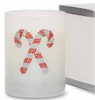
Candy Canes / CIWCANE ◆ Peppermint and spearmint