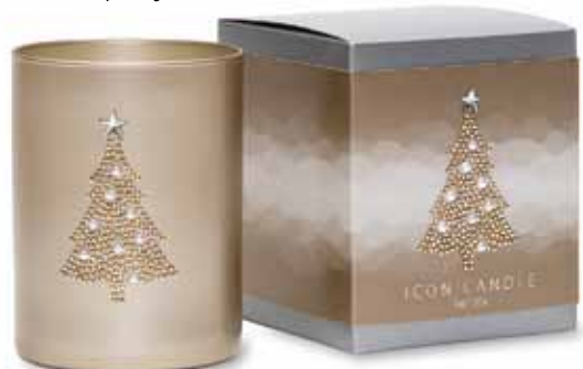
Christmas Tree / CIGXMAS ▲ A potpourri of orange peel and dried fruit