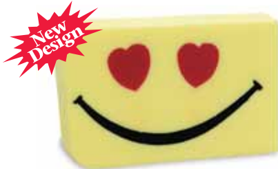
Smiling Face with Heart Eyes ▲ Romance sparkles with notes of citrus, simple syrup and splash of gin. SLHEYES / SCHEYES / SWHEYES