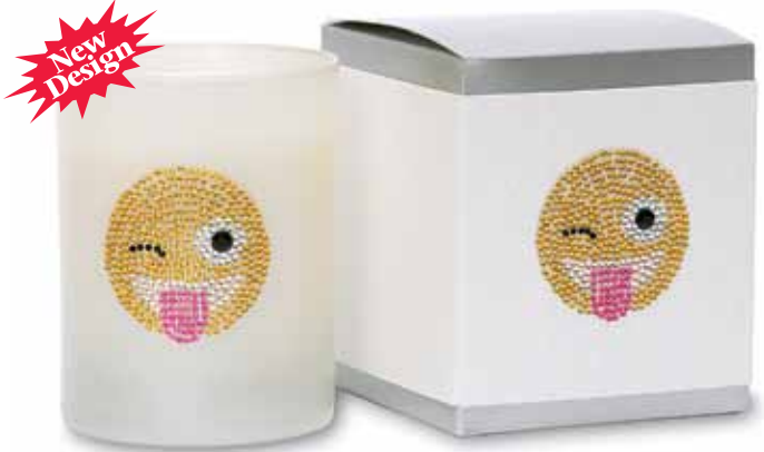
Face with Stuck out Tongue and Winking Eye / CIETONGUE Dreamy and delicious yellow butter cake and creamy frosting