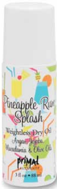
Pineapple Rum Splash / DOROPRS ✨