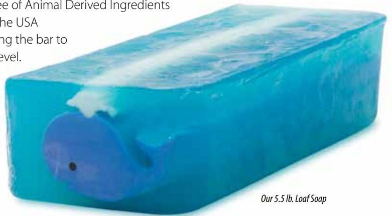
Our 5.5 lb. Loaf Soap

This takes raising the bar to a whole new level.