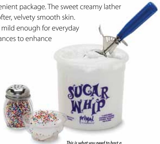
This is what you need to host a Soapy Sundae party in your store