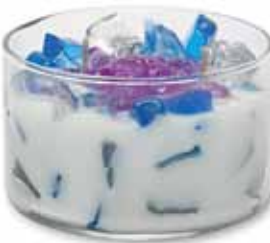
Seashells & Starfish ✨ Watery fresh notes of lemon, geranium, bergamot and mandarin. CBSSSF