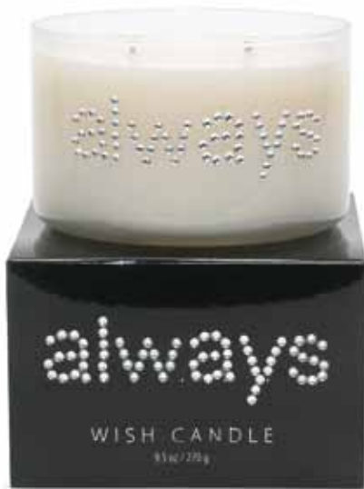
Always / WCAL ☀️ Sugar kissed citrus