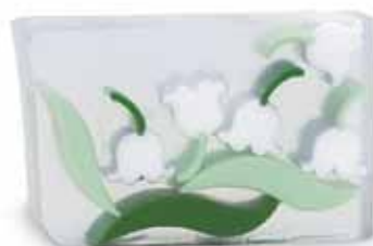
Lily of the Valley ✿ Sweet Lily of the Valley is a classic floral fragrance enhanced with notes of lilac and jasmine. SLLV / SCLV / SWLV