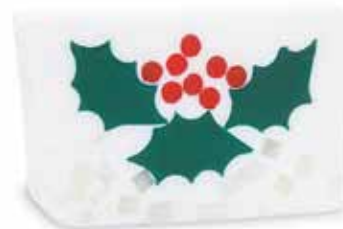
Holly Berry ◆ Bring on the holidays! A wonderful bar with a minty, floral scent. D415,590 SLHB / SCHB / SWHB