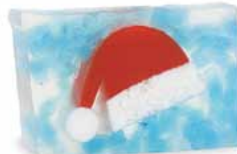
Santa's Cap ✨ A jolly red cap wrapped in a wintry floral mix. SLSCAP / SCSCAP / SWSCAP