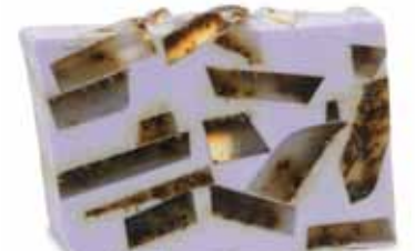
Lavender ● Soothing and relaxing lavender essential oil calms the soul and lavender buds provide mild exfoliation. SLLEO / SCLEO / SWLEO