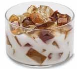
Frosted Gingerbread ▲ Fresh from the oven gingerbread with creamy vanilla frosting. CBFG