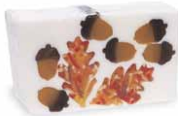
Winterfall ✨ Autumn foliage and warm nutty acorns tucked inside a bar of herbal green notes and rich woods. SLWF / SCWF / SWWF