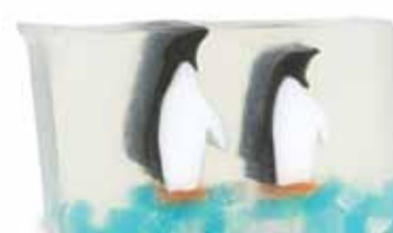
Penguins ◆ Mellow fruit and sparkling citrus pamper these playful pals. SLPEN / SCPEN / SWPEN