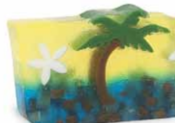
Paradise Sunset ▲ The tropics are at your fingertips with this soap! Enjoy the luscious aromas of coconut and banana. SLPS / SCPS / SWPS