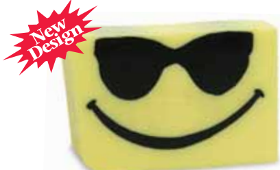
Smiling Face with Sunglasses ▲ This bar has notes of island coconut, sweet apple and creamy vanilla. SLSMILESUN / SCMILESUN / SWMILESUN