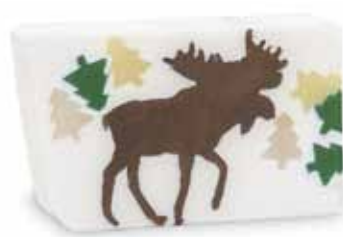
Chocolate Moose ▲ A chocolate moose in a creamy chocolate mousse. SLCHO / SCCHO / SWCHO