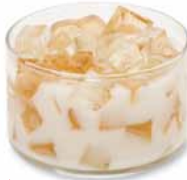
Cinnabun ▲ Aroma of irresistible cinnamon rolls with rich creamy icing. CBCN