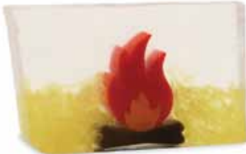
Campfire ▲ Enjoy the smoky notes of tobacco leaf and warm vanilla in this campy bar of soap. SLCFIRE / SCCFIRE / SWCFIRE