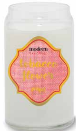
Tobacco Flower ❁ Blackberry, tobacco flower and oud. MRCTF