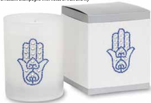
Hamsa / CIWHAMSA ◆ Effervescent champagne with notes of fruit and lily