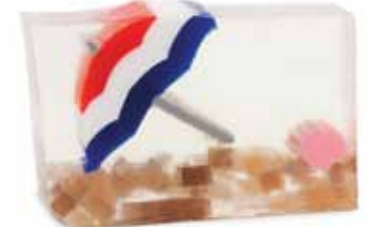
Life's A Beach ✕ Relax and enjoy the juicy fruit goodness swimming in vanilla and musk. SLLAB / SCLAB / SWLAB