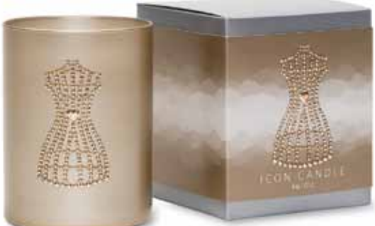
Dress Form / CIGDF ❁ Sophisticated floral and amber