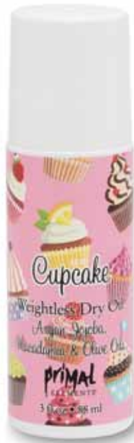
Cupcake / DOROCUP ▲