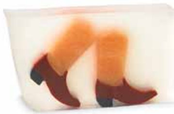
Boots ✿ A round up of soft suede and citrus. SLBOOT / SCBOOT / SWBOOT