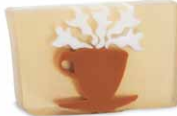
PSL ▲ Fresh picked pumpkin and buttery crust with a twist of citrus and a hint of spice. SLPSL / SCPSL / SWPSL