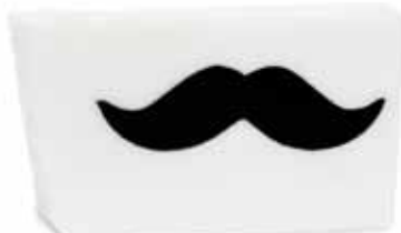
Mustache ◆ Subtle citrus and woody sandalwood are dusted with spicy nutmeg. SLMUS / SCMUS / SWMUS