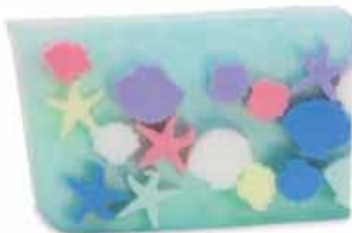
Seashells & Starfish ✨ Watery fresh notes of lemon, geranium, bergamot and mandarin. All wrapped in a breezy beach accord. SLSSSF / SCSSSF / SWSSSF