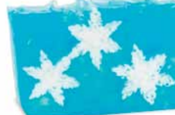
Snowflakes ◆ Icy snowflakes drift through this bar of fresh and minty winter delight. SLSF / SCSF / SWSF