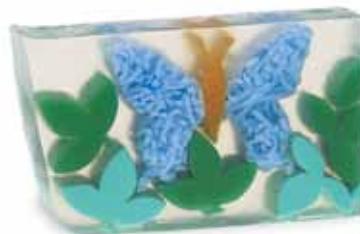
Papillon en Bleu ✿ Exotic floral aroma of violet flowers, jasmine, muguet and Casis. Topped with sparkling citrus notes. SLPB / SCPB / SWPB