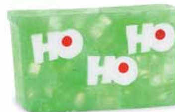
Ho Ho Ho ✕ Holiday cheer sprinkled with sweet sugarplum. SLHOHOHO / SCHOHOHO / SWHOHOHO