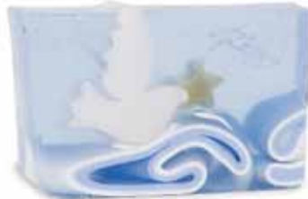
Skyward ◆ A dove above the clouds. An elegant bar with a clean, clear scent. D416, 107 SLDO / SCDO / SWDO