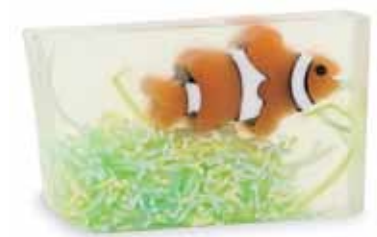
Clownfish ◆ Our colorful Clownfish splashes in a sea of cool water with a splash of sparkling pear. SLCFISH / SCCFISH / SWCFISH