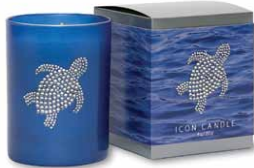
Sea Turtle / CIBTUR ★ Coconut lime verbena