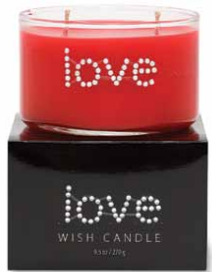
Love / WCLOVE ✿ Entwines exotic woods with sensual florals