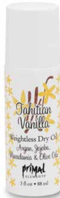
Tahitian Vanilla / DOROTV ▲