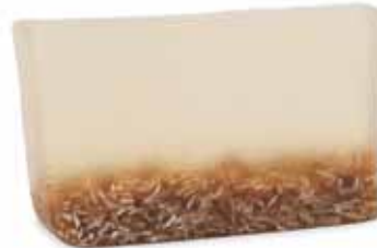
Lavender Oatmeal ● Lavender calms and soothes the skin while oatmeal exfoliates gently. SLL / SCL / SWL