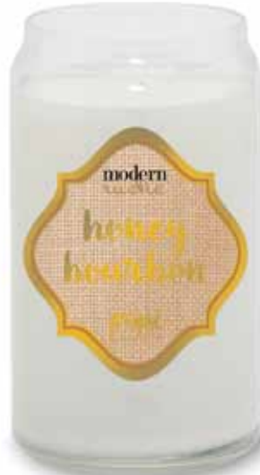
Honey Bourbon ▲ Rich honey and bourbon whiskey. MRCHB