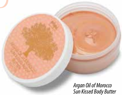
Argan Oil of Morocco Sun Kissed Body Butter

Our Argan Oil of Morocco Sun Kissed Body Butter is a lightweight body treat that imparts a sunny glow to the skin that looks like you have been kissed by the sun.