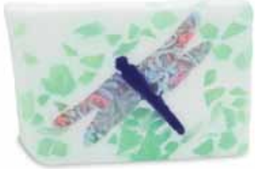
Dragonfly ◆ A blend of floral notes, leafy greens, a touch of tangerine and a dry down of exotic woods and soft musk. SLD / SCD / SWD