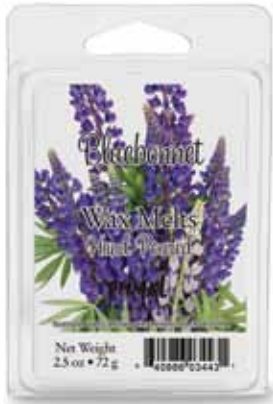
Bluebonnet / WAXBB 🌸

Primal Elements Wax Melts provide hours of flameless aromatic delight. These easy to use scent cubes provide inviting aroma to any space in the home. Simply break off the cubes as desired and place in the wax melter. As the wax gently melts, the aroma is released into the air to gently fragrance the area for hours. Primal Elements Wax Melts are designed to be used with any certified device designed to be used with wax melts. We are pleased to offer Wax Melts in the following favorite Primal Elements fragrances: Bluebonnet, Cinnabun, Citrus Melon Mint, Cupcake, Grapefruit, Lavender, Maple Donut, Pineapple Rum Splash, Plumeria, Seashells and Starfish, Sparkling Sugar and Tahitian Vanilla .