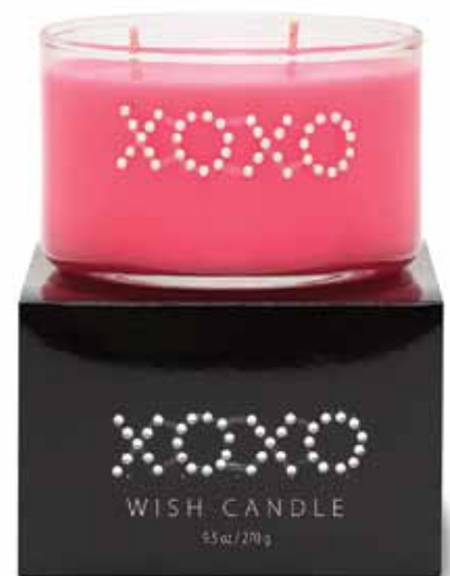
XOXO / WCXOXO ✨ A burst of sunny berries wrapped in cream