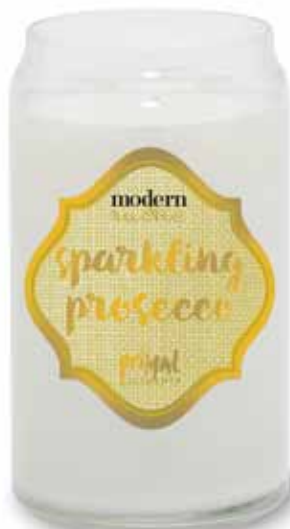
Sparkling Prosecco ◆ White grape, flowery peach and vanilla bean. MRCSF