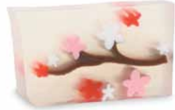
Cherry Blossom ★ A hint of sweet cherry and bright floral blossoms. SLCB / SCCB / SWCB