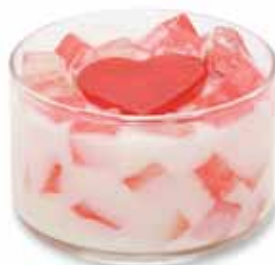
Cherish ✂ The juicy aroma of mixed berries in sweet vanilla. CBCH