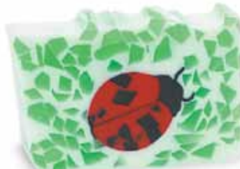
Ladybug ✕ Our lovely ladybug skips through a sunny orange, mimosa and violet fragrant bar. SLLB / SCLB / SWLB