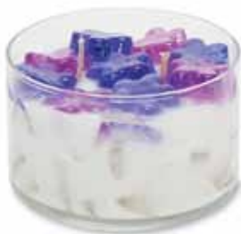
Lilac ✿ A traditional garland of fragrant flowers. CBLIL