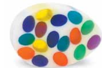
Jelly Beans ✕ Pastel eggs wrapped in a fruity scented candied bar. SLJB / SCJB / SWJB