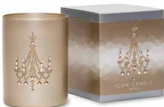
Chandelier / CIGCHAN ▲ Decadent sweet spun sugar