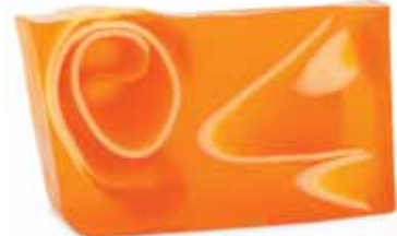
Tomato Juice Complexion Bar ● Tomato juice, baking soda and lemon essential oil for gently cleansing your face and body. No color added, pure and simple. SLTOM / SCTOM / SWTOM