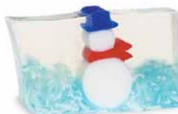
Snowy ◆ A true winter delight! Warm musk thaws the frosty citrus blend of crisp geranium and Christmas lily notes. SLSN / SCSN / SWSN