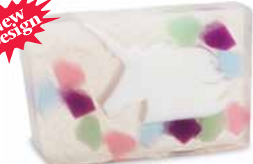
Unicorn ✨ This flight of fantasy is a magical blend of stonefruit and white flowers on a delicate bed of musk. SLUNI / SCUNI / SWUNI