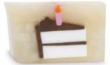
Birthday Cake ▲ Put another candle on this yummy butter cake delight. SLCKE / SCCKE / SWCKE