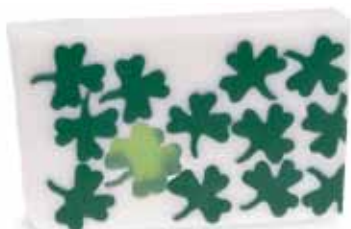
Little Bit O'Luck ▲ The odds will be in your favor with this aromatic bar of Irish mint, cocoa and clover. SLLBL / SCLBL / SWLBL