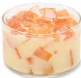
Grapefruit 🌟 An invigorating burst of tart citrus. CBGRA