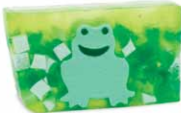
Green Frog ✕ The scent of kiwi kisses. SLFROG / SCFROG / SWFROG