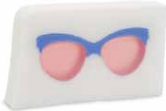
Sunglasses ✕ Just keep cool with sunny pineapple, fresh oj, island rum and shades of musk. SLSUNG / SCSUNG / SWSUNG