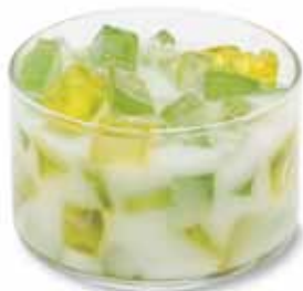
Citrus Melonmint ✂ Sparkling fresh citrus with a twist of mint wrapped melon. CBCMM