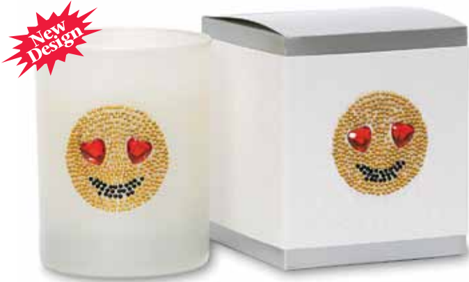
Smiling Face with Heart Shaped Eyes / CIEHEYES Sparkling fresh citrus and sweet simple syrup