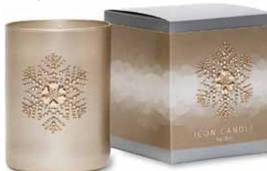
Snowflake / CIGSF ◆ Wintery cool mint and citrus