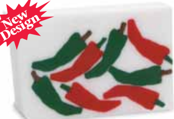
Chilifest ✕ Hot from the garden. Herbal notes with a hint of lemon and sweet chili. SLCFEST / SCCFEST / SWCFEST