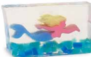
Mermaid ◆ Juicy citrus and fresh florals swim through this aqua fresh bar. SLMER / SCMER / SWMER