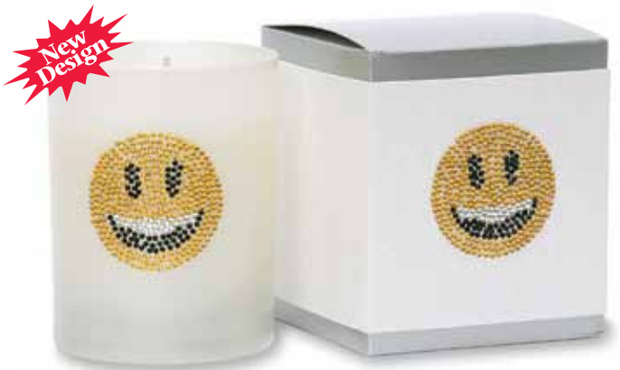
Smiling Face with Open Mouth / CIESOMH Bright citrus with a sweet Hawaiian breeze

Share a smile, a wink or throw some shade with Primal Elements new Icon Candles. Each whimsical design is hand-poured for optimum fragrance throw and features our proprietary soy and vegetable wax blend and cotton lead free wicks. Our sparkling hand jeweled on trend Icon Candles are paired with matching hand jeweled gift boxes; making these candles a perfect gift for any occasion. With approximately 50 hours of aromatic burn time these comical candles will surely make everybody smile.