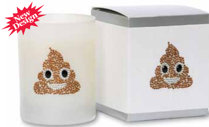
Pile of Poo / CIEPOO Dark chocolate cake with fudgey icing