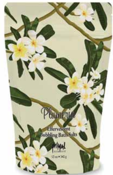
Plumeria Bubbling Bath Salts / BBSPLU ✨ The sweet fragrance of Plumeria Blossom is wrapped in a summer breeze carrying notes of jasmine, peach and delicate citrus.