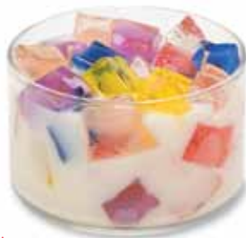
Cupcake ▲ Dreamy and delicious yellow buttery cake scent. CBCUP