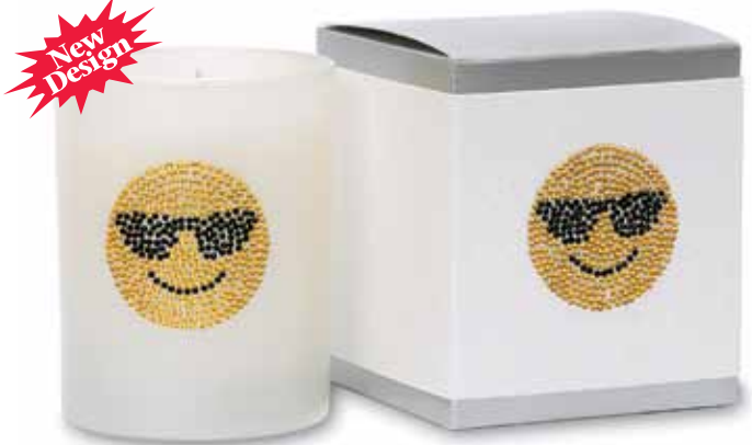
Smiling Face with Sunglasses / CIESUNG Tropical island coconut with sweet apple and anise wrapped in vanilla