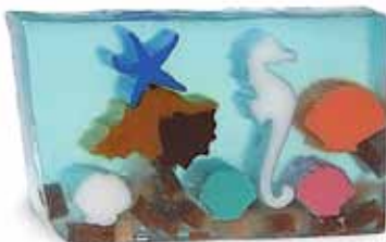
Marine Life ◆ A shimmering view under the sea! Crisp and clean, with a hint of green herbaceous notes. SLML / SCML / SWML