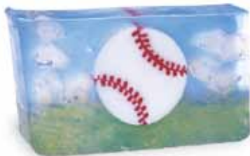
Baseball ◆ Score with this fresh ozone mist fragrance. It's sure to be a hit! SLBASE / SCBASE / SWBASE