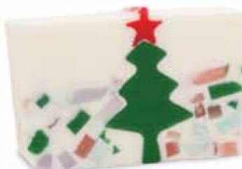
Holiday ▲ A potpourri of holiday memories. Orange peel and dried fruit intertwined with nutmeg, clove and cinnamon. SLXMAS / SCXMAS / SWXMAS