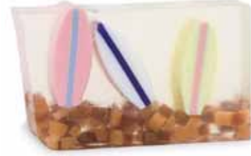
Surf City ✿ Hang ten with a radical combination of sweet sugar and fresh citrus. Surfboard colors are random. SLSC / SCSC / SWSC