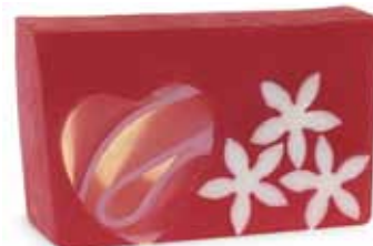
Flowers & Hearts ★ The scent of rose envelopes our romantic heart in a bed of white flowers. SLHE / SCHE / SWHE