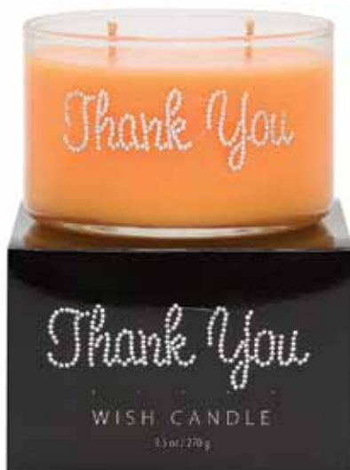
Thank You / WCTY ▲ Warm roasted chestnuts wrapped in sweet vanilla