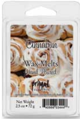
Cinnabun / WAXCN 🍩