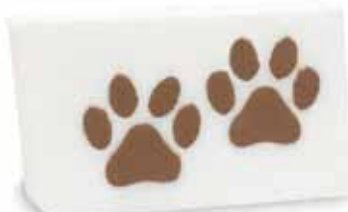
Paw Prints ☆ Rusty and Ginger stamp their paws of approval on this sweet soap. SLPAW / SCPAW / SWPAW