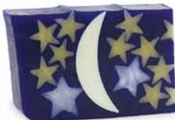
Midnight Moon ✧ Warm sensual spices, rich oakmoss, exotic woods and patchouli create an Eastern influenced aroma. D413,692 SLMM / SCMM / SWMM