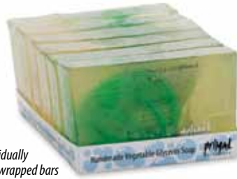
6 individually shrink wrapped bars

your convenience, we recommend our three-dimensional loaves be ordered precut, as they may not fit into our jig.