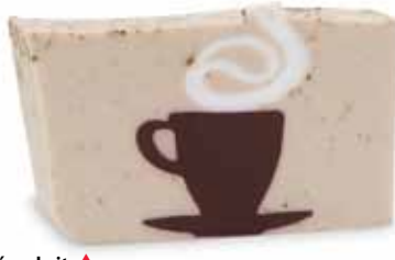
Café au Lait ▲ Rich, creamy coffee aroma blended with real coffee grinds to remove cooking odors from busy chef's hands. SLCAFE / SCCAFE / SWCAFE