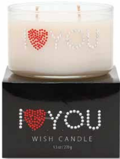
I HEART YOU / WCIHY ★ A message of love wrapped in dewy florals