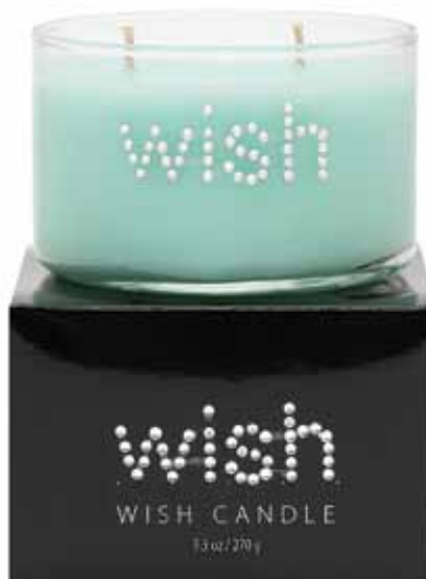
Wish / WCWISH ◆ A delicate blend of citrus and fresh flowers