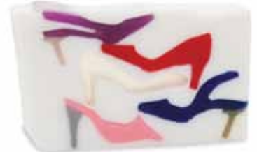
Imelda ◆ Satisfy your shoe fetish with this bar featuring fresh citrus, florals and sensually sweet vanilla and musk. SLIM / SCIM / SWIM