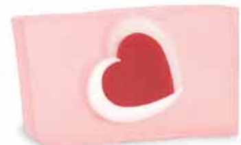
Cherish ✕ The juicy aroma of mixed berries enveloped in sweet vanilla will surely please the one you cherish. SLCH / SCCH / SWCH