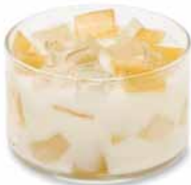
Almond Biscotti ▲ Twice-baked almond cookies. CBAB