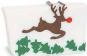
Rudy ▲ A flying reindeer full of vanilla, citrus, florals and sandalwood. SLRUDY / SCRUDY / SWRUDY