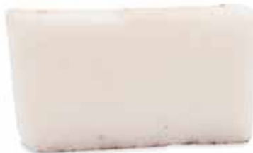
Almond Honey ▲ Vitamin rich almond meal gently exfoliates the skin and the sweet honey almond fragrance is a bathing treat. SLAH / SCAH / SWAH