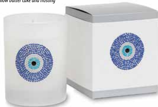
Evil Eye / CIWEYE ◆ Effervescent champagne with notes of fruit and lily