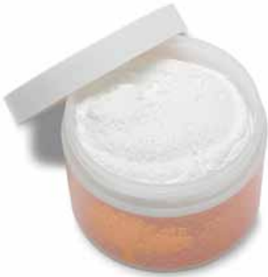
Sugar Whip The core of personal care collection is a cleanser, scrub and moisturizer all in one.

nourishes the hair strands to add shine and body to all hair types while gently detangling.