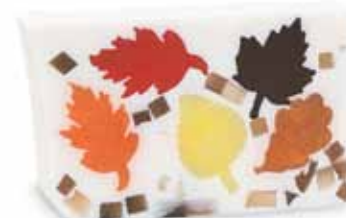
Autumn Leaves ▲ The colors of fall wrapped in a fragrant blanket of roasted chestnuts. SLAUT / SCAUT / SWAUT