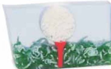
Teed Off ◆ Tee off with a bar filled with the fresh, clean scent of citrus and mediterranean notes. SLTO / SCTO / SWTO