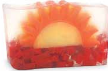
Sunrise/Sunset ★ Brightly bursting on the scene! Greet the day with sunny citrus and a floral finish. SLSUN / SCSUN / SWSUN