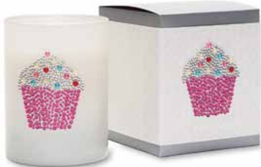
Cupcake / CIWCUP ▲ Yellow butter cake and frosting