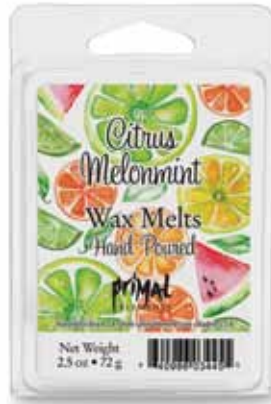
Citrus Melonmint / WAXCMM 🍋