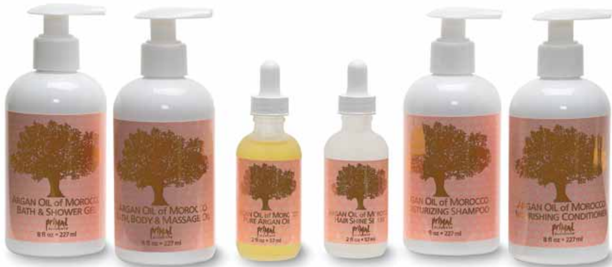
Bath and Shower Gel / MAWASH, Bath, Body & Massage Oil / MAOIL, 2 oz. Pure Argan Oil / MAPOIL, Hair Shine Serum / MAHSS, Moisturizing Shampoo / MA32, Nourishing Conditioner / MAHC