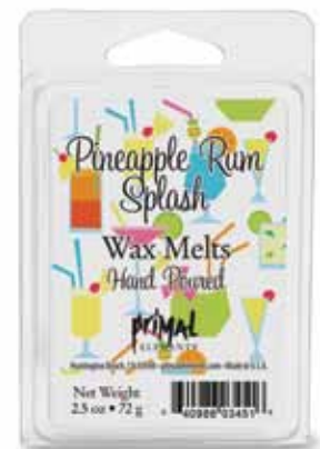
Pineapple Rum Splash / WAXPRS 🍹