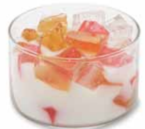
Confection ▲ The decadent aroma of caramel with a squeeze of juicy citrus and soft amber. CBCNF