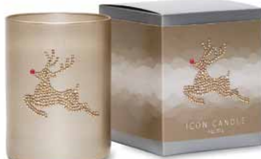
Rudy / CIGRUDY ▲ Warm vanilla, citrus and sandalwood