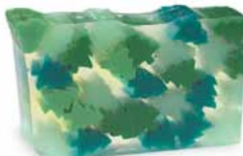
Evergreen Twist ✱ A herbal-woody blend. Notes of lemon, siberian fir and wild mint. Just a hint of eucalyptus for a fresh twist. SLET / SCET / SWET