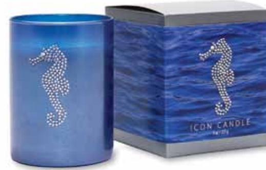
Seahorse / CIBSH ◆ Fresh seaspray