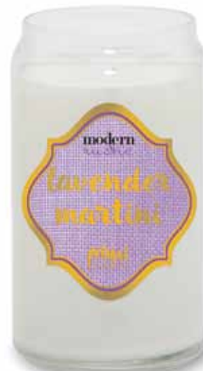
Lavender Martini ✨ Vanilla vodka, lavender and lemon. MRCLM