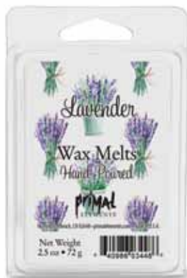
Lavender / WAXLEO 🌿