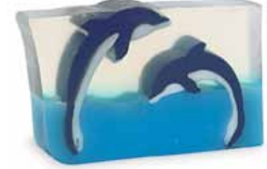
Dueling Dolphins ◆ Lively dolphins leap from this watery fresh fragranced bar. SLDD / SCDD / SWDD