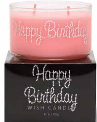
Happy Birthday / WCHB ▲ Sweet and creamy frosted cupcake