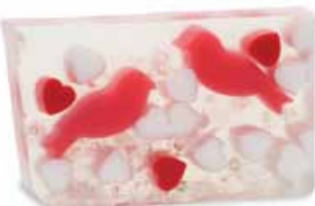
Love Birds ◆ This flirty and fun bar of soap is sweet with notes of white apricot, lily and musk. SLBIRD / SCLBIRD / SWLBIRD