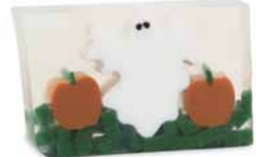
Ghoul Friend ✕ A frightfully fruity scented bar. SLGH / SCGH / SWGH