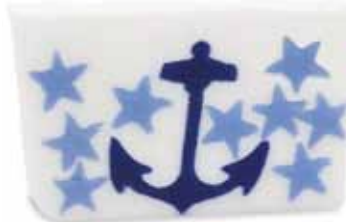
Anchor ◆ Notes of cool cucumber and sunny melon anchor this nautical inspired bar. SLANC / SCANC / SWANC