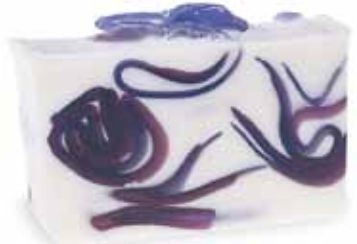
Ariel ✿ Sandalwood and sensual musk with notes of patchouli and moss create an aroma of incense and driftwood. SLA / SCA / SWA