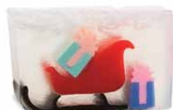
Santa's Sleigh ✕ Santa's sleigh is on its way in a bar of wintry fresh flowers and mint. SLSL / SCSL / SWSL