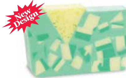
Guacamole ▲ Cool and creamy avocado is blended with notes of crisp lemon and lime. SLGUAC / SCGUAC / SWGUAC