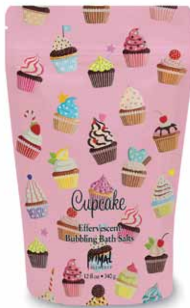
Cupcake Bubbling Bath Salts / BBSUCP ▲ Dreamy and delicious yellow buttery cake scent.