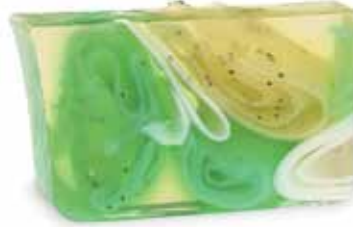
Lemongrass and Cranberry Seeds ● Wake up with an invigorating blast of lemongrass! Cranberry seeds provide gentle stimulation. SLLG / SCLG / SWLG