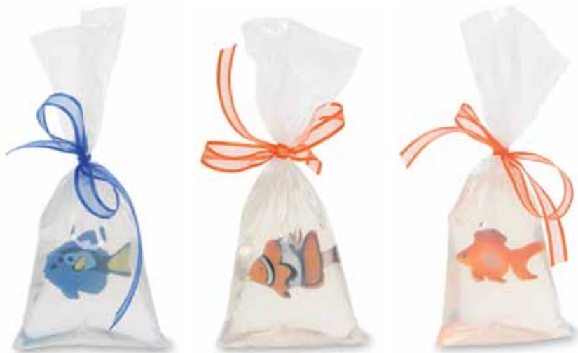
Blue Tang SFBBLUE

Just like the carnival prize but you don't have to feed them! An adorable plastic fish swims in a glycerin soap sea with our delicate Facets of the Sea fragrance. Find three familiar fishes; Blue Tang , Clownfish and Goldfish , swimming your way; these cuties are sure to please. Each Fish in a Bag is 3.5 oz (100 grams) and is available in a twenty four piece pack.