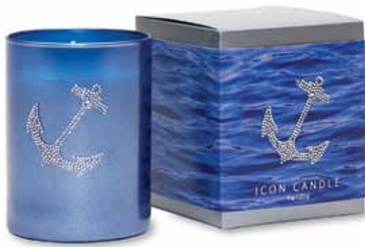
Anchor / CIBANC ◆ Fresh and clean watery fresh citrus