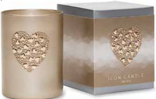
Heart of Hearts / CIGHOH ❁ Exotic sandalwood, floral and musk