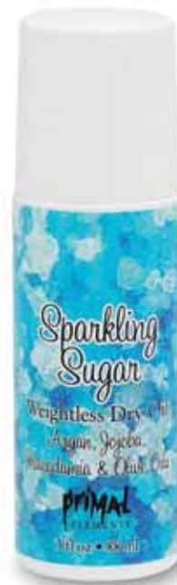
Sparkling Sugar / DOROSS ▲