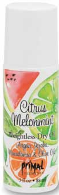
Citrus Melonmint / DOROCMM ✨

The weightless formula features a unique botanical blend of rosemary extract, sunflower extract, and natural vitamin E to provide powerful antioxidant protection, and the restorative properties will leave skin feeling soft and smooth; your skin will thank you for it! Naturally Luxurious Dry Oil is available in a three ounce roll on; making it perfectly portable. Available in the following fragrances; Citrus Melonmint, Cupcake, Grapefruit, Lavender, Pineapple Rum Splash, Plumeria, Seashells and Starfish, Sparkling Sugar and Tahitian Vanilla.