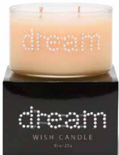
Dream / WCDREAM ▲ Sweet and creamy rich vanilla