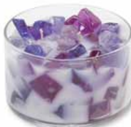
Winterberry ✨ Fresh picked berries dusted in sugar. CBWB