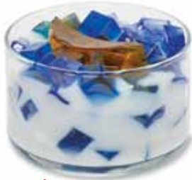
Midnight Moon ✿ Exotic woods and patchouli mingled with sensual spices and oakmoss. CBMM