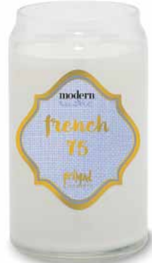
French 75 ☀️ Sparkling citrus, gin and simple syrup. MRCF75