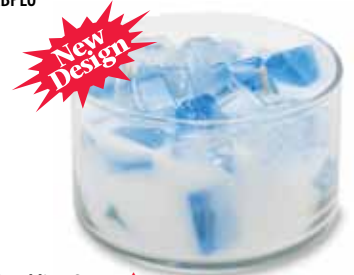
Sparkling Sugar ▲ Sweet spun sugar with a dusting of caramel and vanilla. CBSS