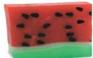
Watermelon ✕ The succulent aroma of a summertime favorite. SLW / SCW / SWW