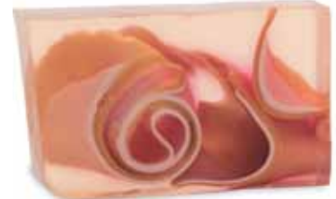
Argan Oil of Morocco ▲ The exotic notes of delicate white flowers, juicy citrus and sultry vanilla. This bar contains pure Argan oil from Morocco. SLMA / SCMA / SWMA