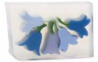
Blue Bells ✿ Sweet melon, pear, and citron are entwined with praline and patchouli. SLBELL / SCBELL / SWBELL