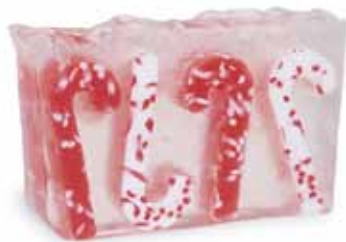
Candy Cane ◆ Peppermint and spearmint accented with ozonic notes blended with orange, tangerine lily, jasmine and musk. SLCANE / SCCANE / SWCANE