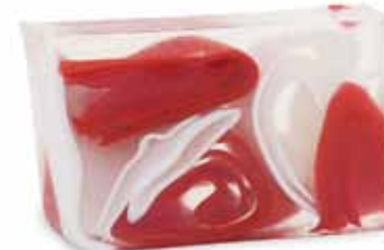
Peppermint ● One of the great ways to start the day. Leaves your skin tingly and cool. SLPE / SCPE / SWPE