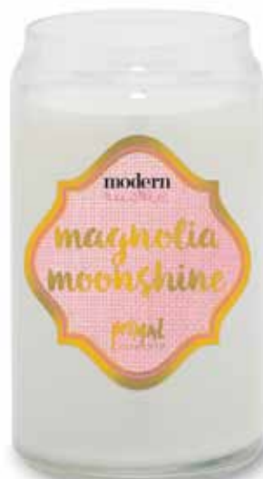
Magnolia Moonshine ★ Sweet magnolia and sunny citrus. MRCMM