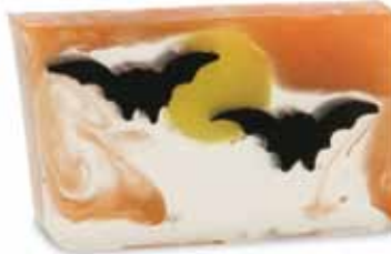
Bats ◆ Bats in an effervescent lemon and lime that refreshes and awakens. SLBAT / SCBAT / SWBAT