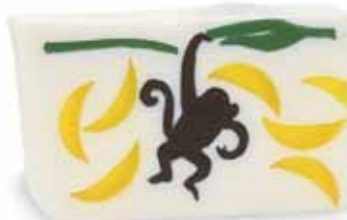
Monkey Business ▲ Go bananas with this tropical treat. SLMONK / SCMONK / SWMONK