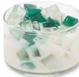
Tranquility ◆ The clean fragrance of cool cucumber and summer melon. CBTR