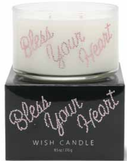
Bless Your Heart / WCBYH 🌸 Fresh cut tulip, tuberose and jasmine