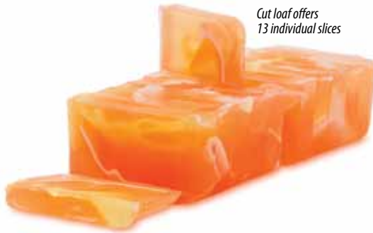
Cut loaf offers 13 individual slices

Our standard Loaf Soap is approximately 4 1/2" x 11" and can be cut in our handy jig that has a premeasured slot. This yields 13 bars of soap from one loaf, plus two end cuts. We recommend that Primal Elements soaps are cut in generous slices to maintain the integrity of the designs and keep the elements embedded in each bar.