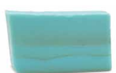
Dead Sea Mud ✨ Mineral Rich mud from the lowest spot on earth leaves skin feeling hydrated and refreshed. Enjoy the notes of citrus, herbs and amber. SLDSM / SCDSM / SWDSM