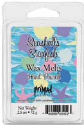
Seashells & Starfish / WAXSSF 🌊