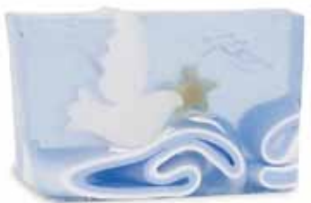
Skyward ◆ A dove above the clouds. An elegant bar with a clean, clear scent. D416,107 SLDO / SCDO / SWDO