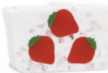
Strawberries ✕ Fresh, juicy strawberries plucked straight from the field. SLSTRAW / SCSTRAW / SWSTRAW