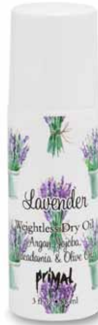
Lavender / DOROLEO ●