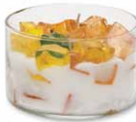
Sweet Tea ✨ Notes of black tea, lemon slices and sugar crystals. CBSTEA