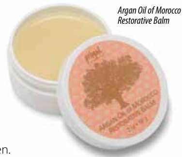
Argan Oil of Morocco Restorative Balm

All Argan Oil of Morocco products showcase our original fragrance which features notes of white jasmine and lily of the valley, cedarwood and sultry vanilla all wrapped in a breezy beach accord. Primal Elements Argan Oil of Morocco can be part of any daily body care regimen.