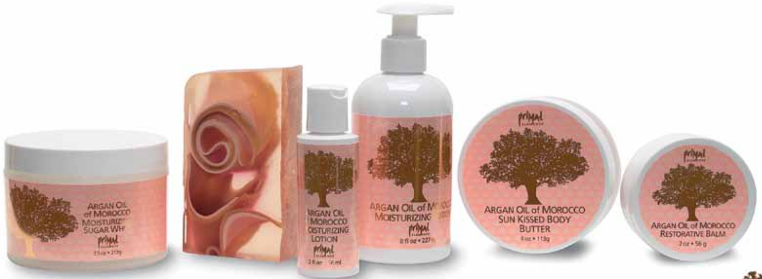
Moisturizing Sugar Whip ® / MASW, Argan Oil Of Morocco Handcrafted Vegetable Glycerin Soap / SLMA / SCMA / SWMA, 2 oz. Moisturizing Lotion / MAC2, Moisturizing Lotion / MAC, Sun Kissed Body Butter / MABB, Restorative Balm / MARB