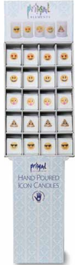
Icon Candle Shipper 20 Icon Candles plus an additional 20 Icon Candles for Backstock OK-CANDLE-ICON