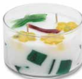
Paradise Sunset ▲ The luscious aromas of coconut and banana. CBPS