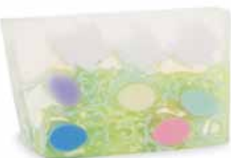
Hippity Hop ◆ Gentle notes of waterlily and peony hop through this springtime fresh bar. SLHH / SCHH / SWHH