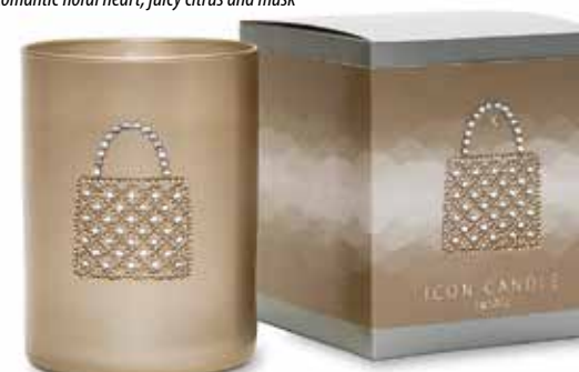
Purse / CIGPURSE ❁ Romantic floral heart, juicy citrus and musk