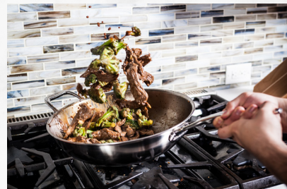
FRY PAN SDCLAD3520i 20cm - 8"

Swiss Diamond is a high-end cookware and kitchenware brand established in 2001. The brand is committed to meeting consumer needs by using safe, high-quality materials, and by adhering to an eco-friendly production process. Swiss Diamond combines innovative designs with traditional European craftsmanship to empower home chefs around the world.