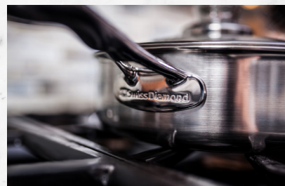
SAUCE PAN SDCLAD31016ic 16cm - 6.5" 2L (2.1 Qt.)