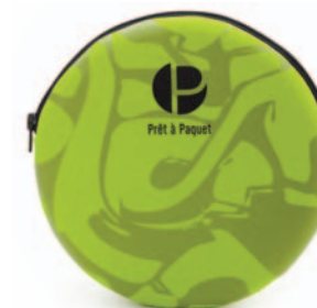
Round Salad Kit