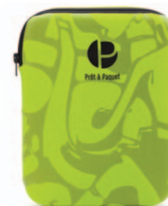
Divided Lunch Kit