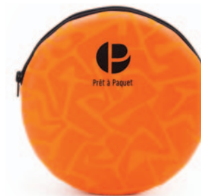
Round Salad Kit