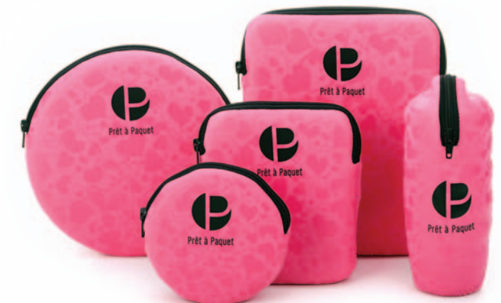
Insulated Drink Bottle