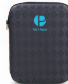
Divided Lunch Kit