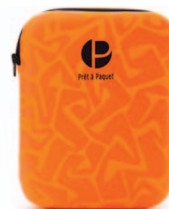
Divided Lunch Kit