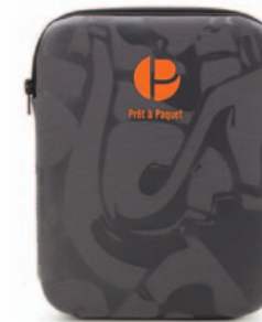
Divided Lunch Kit