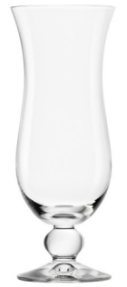
483 00 25 Acapulco 17oz