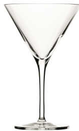
205 00 25 Martini 8.75oz