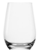
352 00 12 Tumbler 16.5oz