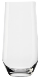
358 00 12 Highball 13.75oz