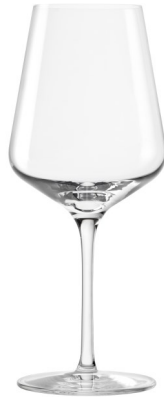
155 00 01 Red 19.25oz