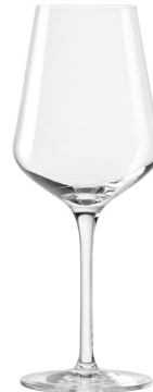
155 00 02 White 13.75oz