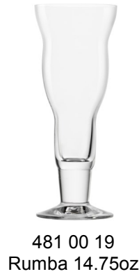
481 00 19 Rumba 14.75oz