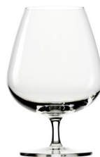
140 00 18 Brandy 21oz