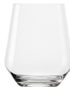
358 00 15 Whisky 13oz