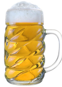
05 008 70 Diamond Beer Stein 17.6 oz