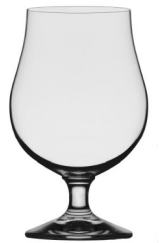
F1730 Berlin Beer 17.5oz