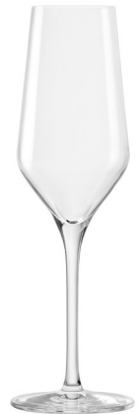
155 00 07 Flute 8.75oz