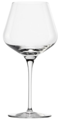
155 00 00 Burgundy 22.5oz