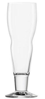
482 00 19 Samba 14oz