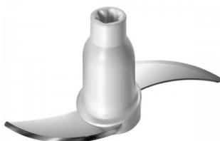
Double Bladed Knife