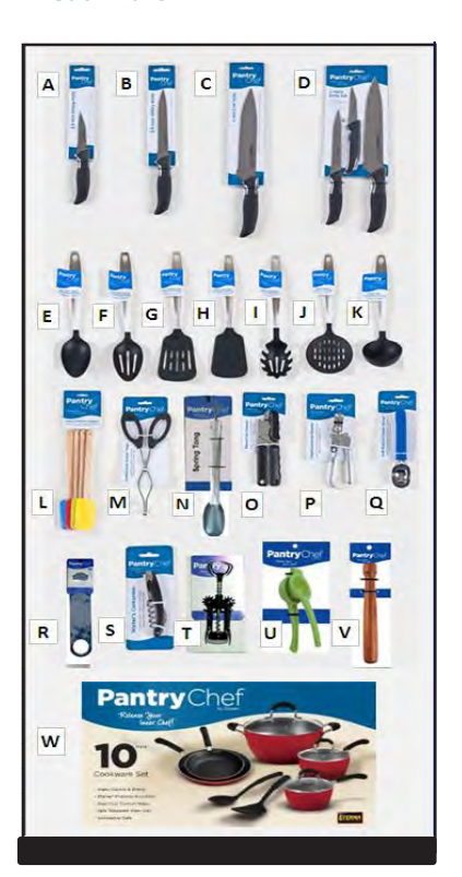
Utensils Wall Complete