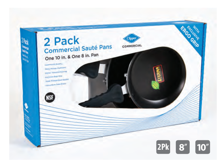
2 Pack 8" & 10" Commercial Sauté Pans