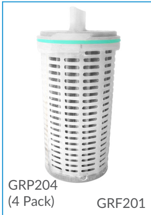
GRP204 (4 Pack)