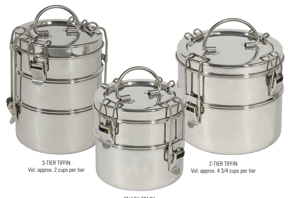
SNACK STACK Vol: approx. 2 cups per tier

These Stainless Steel Tiffin Sets are reusable, lightweight, and have lids that double as a plate! Great for both cold and hot food, these Tiffin's are easy to carry and clean, and hard to live without. Available in three sizes and designed with the planet in mind.