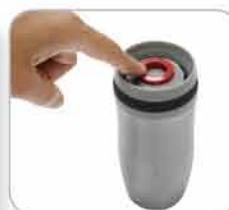
Push button to open and drink from any side