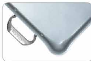
Convenient pouring spout