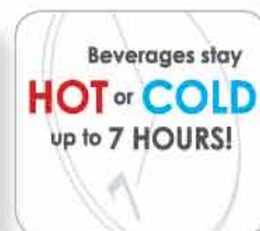
Copper layer allows beverages to stay HOT or COLD for up to 7 HOURS!