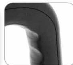
Comfortable Stay Cool Handle