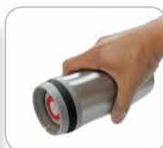
No spill silicone seals