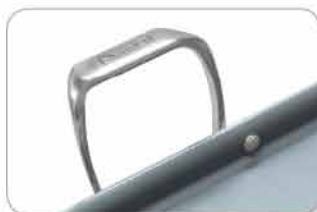
Unique offset handles