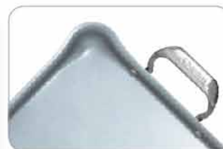
Available without PFOA and PFOS nonstick coating or stainless steel

Excellent for pancakes, bacon, burgers, quesadillas and more! Stovetop and oven safe up to 500°F/260°C.