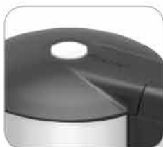
Lid Open Button