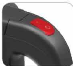
Automatic OFF Switch