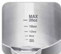
Water Level Gauge

All Stainless Steel Interior • BPA-Free! Perfect for Small Spaces!