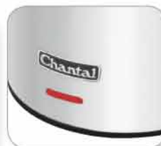
Indicator Light Illuminates While Kettle is heating