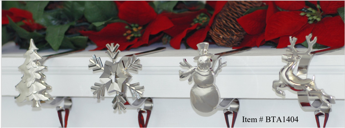
Item # BTA1404