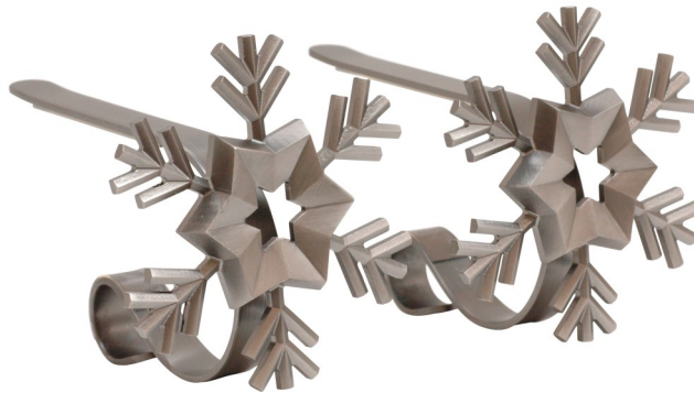
Item # BTW1240

Easily clips onto front of MantleClip ™ stocking holder