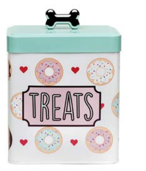
Retro Treats Matte Metal Canister Black 7CN609 | Pack 6 | $8.20 5.5" D/8" H/72 oz Handwash with Care