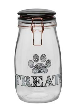
Benji Glass Canister