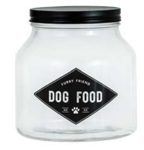
Furry Friend Glass Canister Small 7CM299 | Pack 6 | $6.10 6.5" D/6.5" H/76 oz Handwash with Care