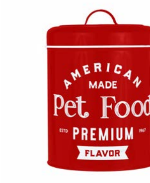
American Made Dog Metal Canister Extra Large 7CDI067 | Pack 6 | $11.80 7" D/10" H/140 oz Handwash with Care