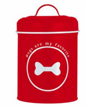
Dogs Favorite Metal Canister Medium 7CDI066 | Pack 6 | $7.70 5.5" D/8" H/64 oz Handwash with Care