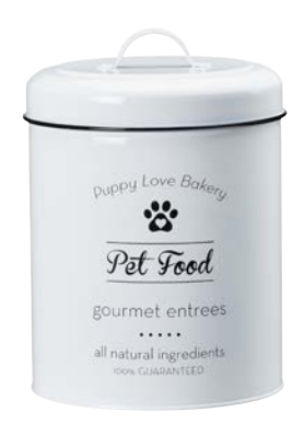
Puppy Love Pet Food Metal Canister 7YY011 | Pack 6 | $15.75 7" D/10" H/140 oz Handwash with Care