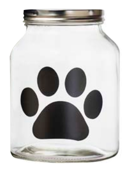
Buddy Paw Chalkboard Glass Canister Medium 7CA113 | Pack 6 | $8.85 6.5" D/8.5" H/108 oz Handwash with Care

7CN529 | Pack 6 | $8.55 6.5" D/8.5" H/96 oz Handwash with Care