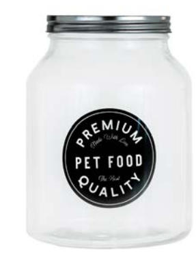
Premium Pet Glass Canister Medium 7CM300 | Pack 6 | $7.10 6.5" D/8.5" H/96 oz Handwash with Care