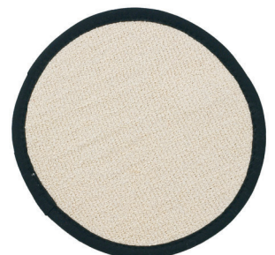
Round Baker's Terry Pot Holder #70000 8in