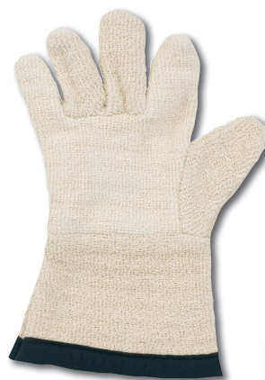
Terry Cook's Glove 13in #70008