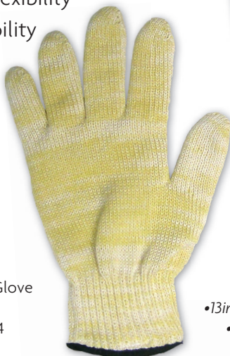
Pyroguard Glove •10in •#90084