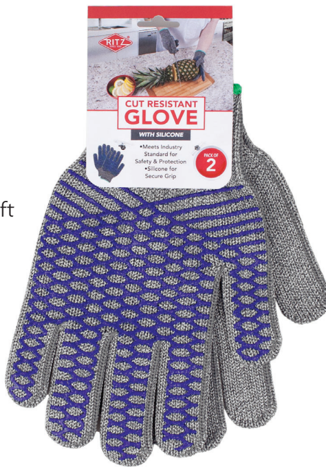
2pk Silicone Cut Resistant Glove #90085 •Enhanced with silicone for secure grip •Pack of 2 provides a glove for each hand