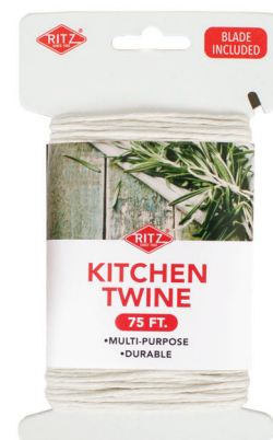
Multi-Purpose Kitchen Twine 75ft #10011