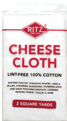
Cheese Cloth 2 Square Yards White #10004