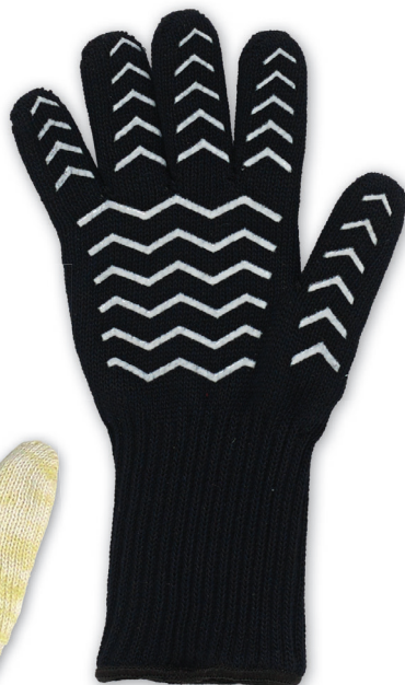
Extra-long Pyroguard Glove •13in, Longer cuff for extra protection •Silicone for easy, non-slip grip #16152