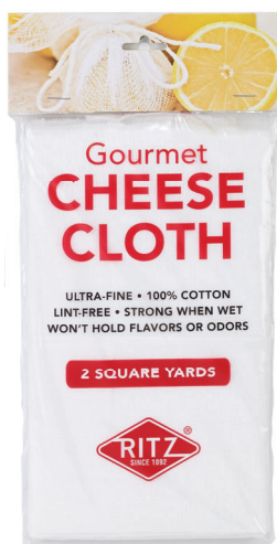
Premium Cheese Cloth 2 Square Yards White #10002