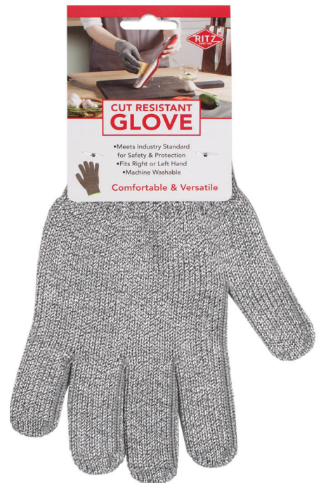
Cut Resistant Glove #90086