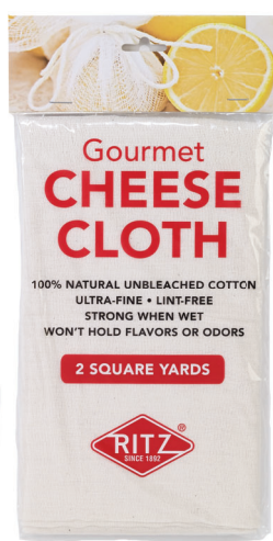
Premium Cheese Cloth 2 Square Yards Natural #10003 •unbleached