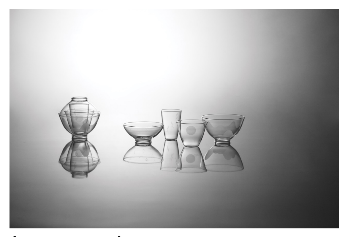
【JIA Inc. Four Seasons Glass Set 】 transform Chinese literary masterpiece into poetic scenery on nesting vessels.

Admire the landscape of four seasons while savoring each season's specialty. Different tints of the glass layered out display an example of beauty just as in a calligraphic painting, while the clear translucence of a spring plate, a summer glass, an autumn bowl and a winter cup complete the full cycle of another year. Inspired by the "Dream of the red chamber", "Four Seasons Glass Set" is your essential companion to enjoy each season. From aperitif and beverage to main course and dessert, this set completes a table of delectable gastronomy with rich visual beauty and flavors all in your hands.