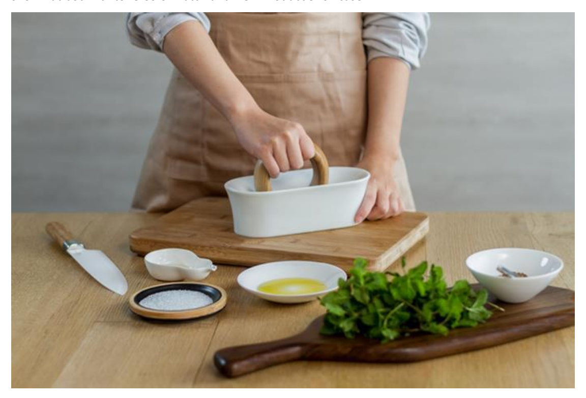
[ JIA Inc. The Prep, Rolling Mortar ] innovates the method of crushing from ancient wisdom, making it easier to grind or mix spices. *IHA Global Innovation Award

This year, the new collection of JIA Inc. will mainly focus at "Cooking" & "Drinking" category, introducing several innovation design pieces with unique Chinese aesthetics. And among various classic and new products to be exhibited at the show, numerous items have also been selected to be shown at both Pantone ColorWatch and New Product Showcase.